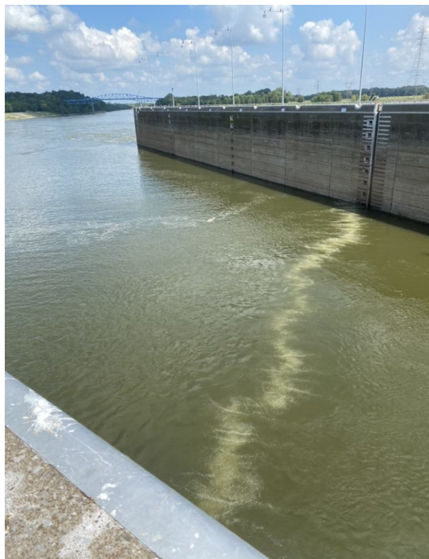
Fig. 3. An experimental BioAcoustic fish fence (BAFF) in operation at the downstream approach channel of Barkley lock on the River Cumberland near Grand Rivers, Kentucky. Photograph shows the air-bubble curtain when the system is turned on. The BAFF is planned to be operated for up to three years for a research study to evaluate its effectiveness to reduce upstream passage of invasive carps.

because populations downstream are greater than populations upstream and fish must use the lock to move upstream past the dam (Post van der Burg et al. 2021). This location is important for resource managers to cut off the source of invasive carps in the Ohio River Basin from migrating into the Tennessee River Basin. The primary objective of the field test at Barkley lock and Dam is to evaluate the effectiveness of a BAFF at preventing telemetered silver carp from moving upstream past the BAFF and into the lock chamber under the wide range of environmental conditions that occur at the site. Three native fish species (paddlefish Polyodon spathula Walbaum; smallmouth buffalo Ictiobus bubalus Rafinesque; freshwater drum Aplodinotus grunniens Rafinesque) are also telemetered as part of the BAFF evaluation to determine potential effects to native fishes.