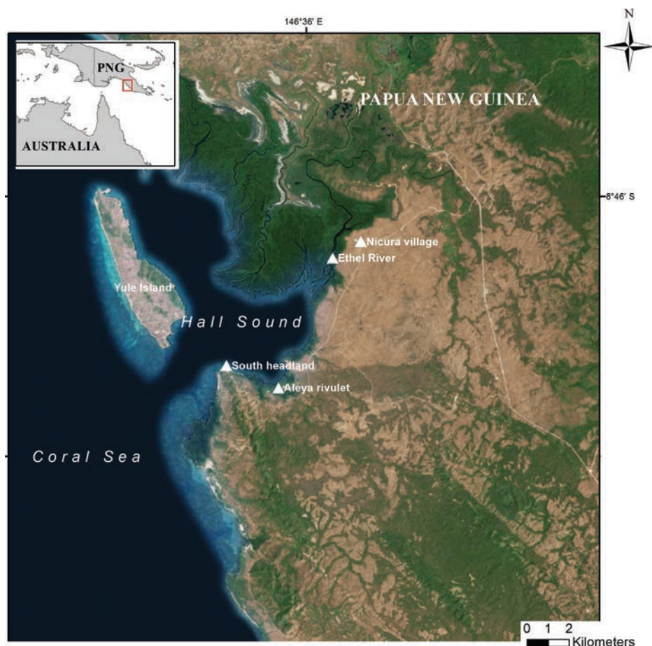
Figure 2. Dr James' collection locations around Yule Island, New Guinea.

The birds that Sharpe described were collected on Yule Island and the New Guinea mainland around Hall Sound (Sharpe 1878) (Fig. 2). This general area was already known