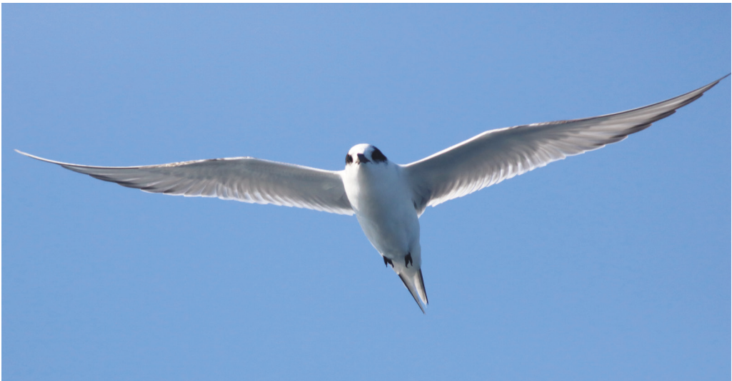
Figure 6. One of a group of Arctic Terns Sterna paradisaea , north of Inhaca Island, Mozambique, 23 July 2017; note uniform-aged primaries unlike in the non-breeding (presumed first-year) Common Terns S. hirundo seen the same day (Gary Allport)

Tanzania (Zimmerman et al. 1996, Stevenson & Fanshawe 2002) or the Malagasy region (Safford & Hawkins 2013).