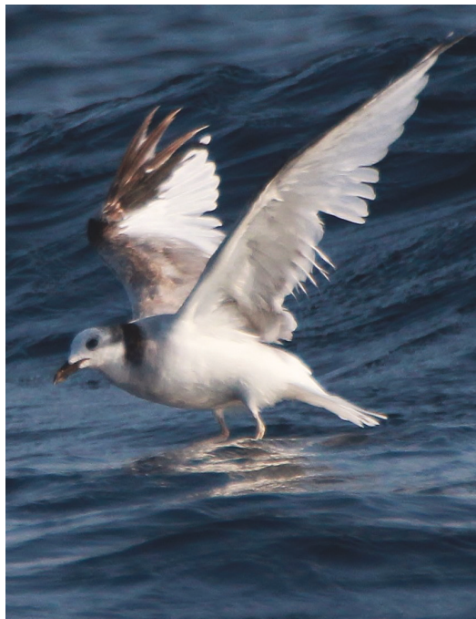
Figure 3. Second-calendar-year Sabine's Gull Xema sabini , north of Inhaca Island, Mozambique, 10 May 2015 (Gary Allport)

Breeds in the Holarctic and migrates south through the Atlantic Ocean to spend the austral summer off southern Africa (Hockey et al. 2005). Rare in Mozambique, the first record was by Lambert (1983), followed by another four, all in February–April north of Inhaca Island (Lambert 2005), including one