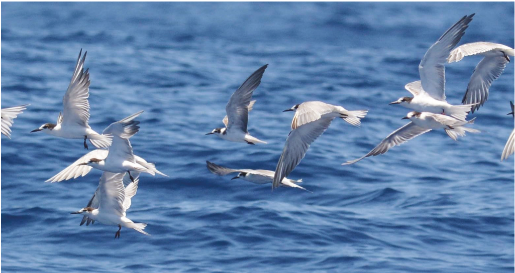
Figure 7. Black Tern Chlidonias niger (centre), Maputo Bay, Mozambique, 31 January 2015

An abundant Palearctic visitor to the southern African west coast in the austral summer, mostly in August–April, but some regularly remain in the austral winter (Brooke & Sinclair 1978, Maclean 1984, Sinclair & Ryan 2003). Uncommon on coasts of South Africa but