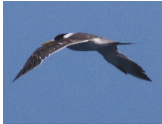
Figure 5. Swift Tern Thalasseus bergii , off Tofo, Inhambane Province, Mozambique, 29 August 2016, possibly of the race velox , showing relatively dark upperwings of a grey tone similar to Lesser Black-backed Gull L. fuscus

T. b. thalassinus breeds on coasts of Tanzania and Kenya, and has much paler upperparts than T. b. bergii , with the grey tone equivalent to Lesser Crested Tern T. bengalensis (see Stevenson & Fanshawe 2002). It is smallest in wing and bill lengths (Table 3) of the first three taxa discussed here. This race has not been confirmed to occur in Mozambique, but it appears probable that T. b. thalassinus is present in at least the northern coastal provinces (see below).