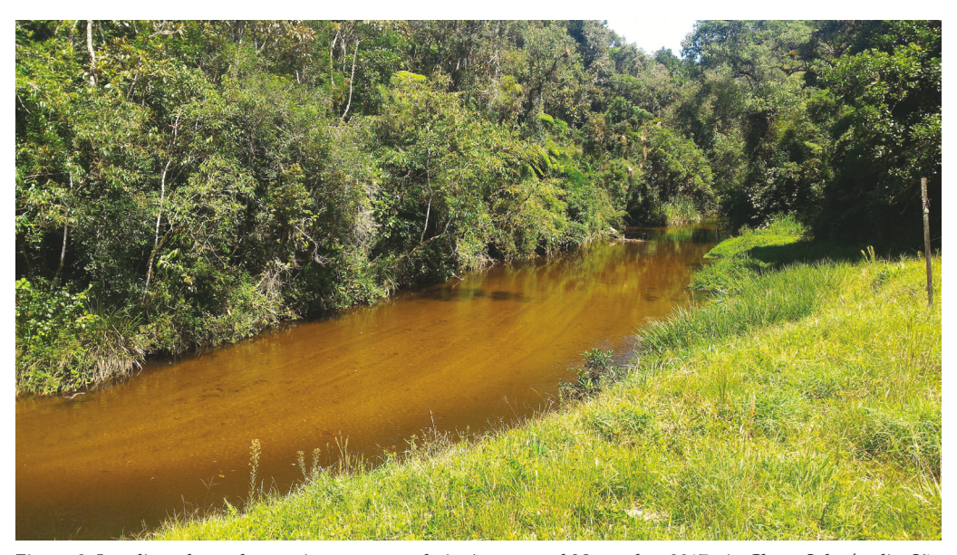
Figure 2. Locality where observations were made in August and November 2017, rio Claro, Salesópolis, São Paulo, Brazil (Miguel Nema Neto)

to its environment and sensitive to human disturbance, activities such as agricultural expansion, pollution, dams and loss of riverine vegetation can all negatively impact the species (Hughes et al. 2006). Recent sightings evidence its survival in Argentina (Misiones) and perhaps even in Paraguay, but in Brazil it is considered extinct in the states of Mato Grosso do Sul, São Paulo, Rio de Janeiro and Santa Catarina (Collar et al. 1992, Lamas & Lins 2009, Carboneras et al. 2018). In Paraná, recent field work has failed to confirm the species' presence and the last record was now more than 20 years ago, in 1995 (Lamas & Lins 2009, Carboneras et al. 2018). Indeed, in recent decades M. octosetaceus has been recorded at just a few locations in Brazil, mainly within protected areas, especially Serra da Canastra National Park (Minas Gerais), Chapada dos Veadeiros National Park (Goiás) and Jalapão State Park (Tocantins) (Braz et al. 2003, Bianchi et al. 2005, Lamas 2006). It has also been reported in western Bahia state, although subsequent searches of this area were unsuccessful (Lamas & Lins 2009). Occasional records elsewhere in Minas Gerais perhaps involve wandering or dispersing birds (Lamas & Lins 2009), although to date there is no definitive evidence that the species moves far from its natal areas (Ribeiro et al. 2011).