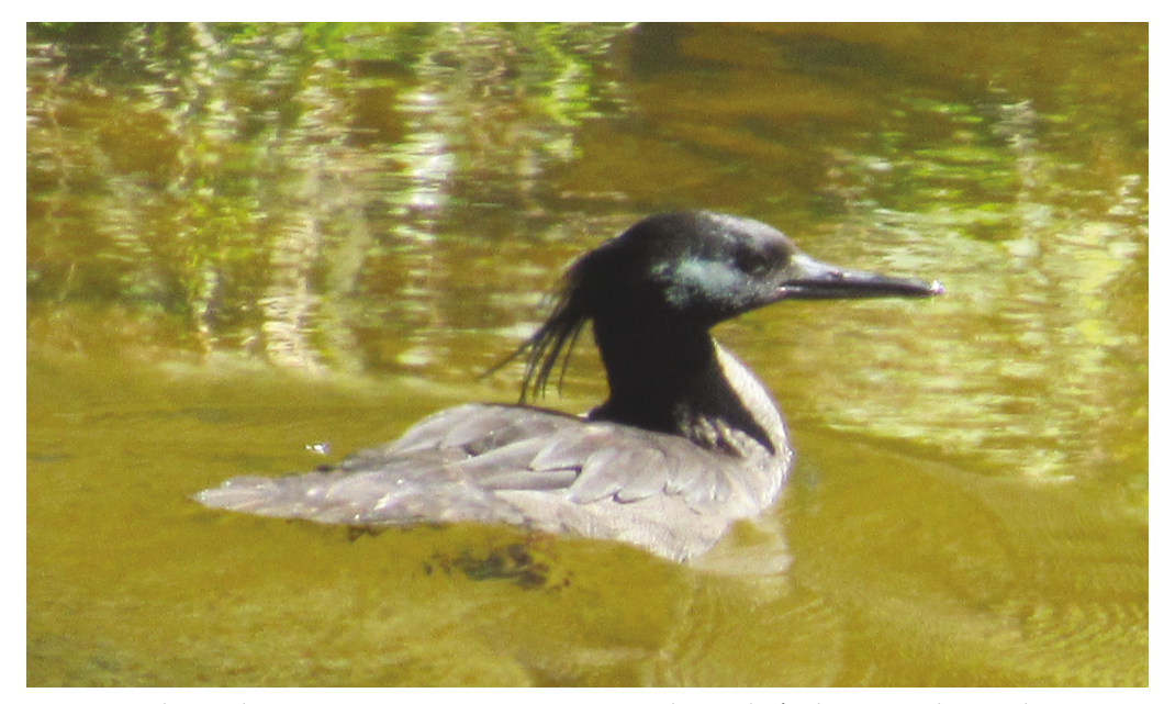
Figure 1. Male Brazilian Merganser Mergus octosetaceus , rio Claro, Salesópolis, São Paulo, Brazil, 25 August 2017 (Fabiana Dias Pereira)

Originally found across south-central Brazil and adjacent Argentina and Paraguay, the species' range is now drastically reduced (Collar et al. 1992), despite its more recent discovery further north than previously known (Braz et al. 2003). Intolerant of impacts