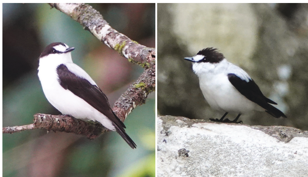
Figure 2. Torrent Flycatcher Monachella muelleriana , Fergusson Island, August 2019 (Jason Gregg)

The birds had a pale grey back, white rump, white throat, breast and belly, black bill and legs, large white forehead spot, and dark brown eyes. The head, wings and tail were black (ML 238404731). No substantial individual variation was observed, even among pairs of suspected males and females, and no individuals matching the description of a juvenile M. muelleriana were observed.