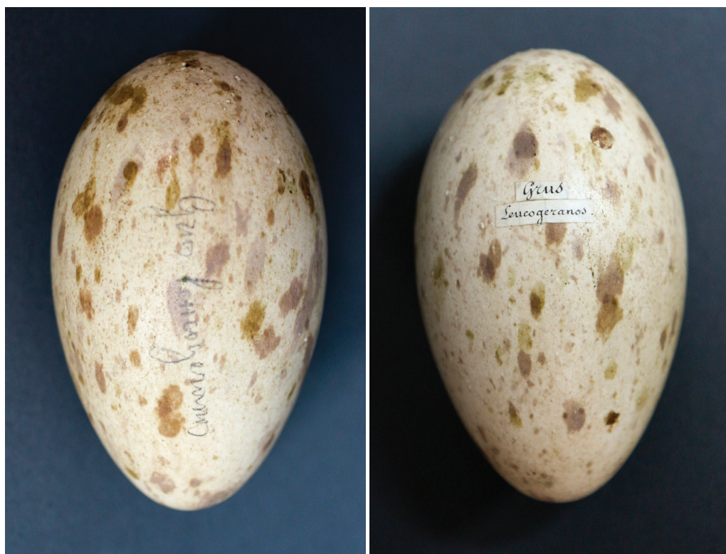
Figure 1. Egg of Siberian Crane Leucogeranus leucogeranus (MDLV.2015.0.4) showing the two different inscriptions

On his return from the North Cape in 1890, Chabrand made a short stopover in St. Petersburg (24–27 July) and Moscow (28–30 July). During his travels Chabrand frequently visited museums and sometimes met their directors or curators (Homps 2010). He visited the 'Parc zoologique' of St. Petersburg (probably what is now the St. Petersburg Zoo)