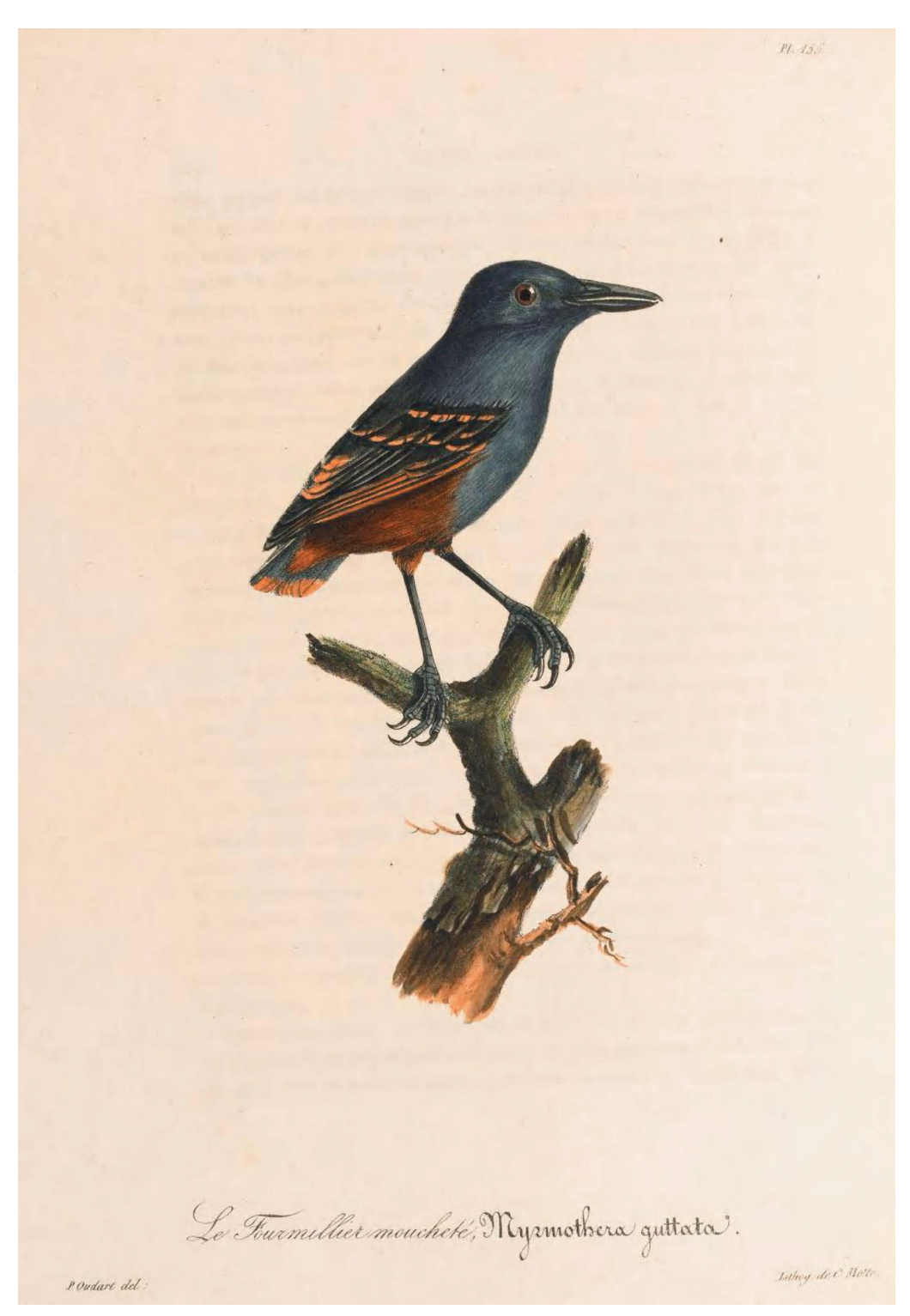
Figure 1. Plate 155 of the Galerie des oiseaux: 'Le Fourmilier Moucheté (Myrmothera guttata)'

© 2022 The Authors; This is an open-access article distributed under the terms of the Creative Commons Attribution-NonCommercial Licence, which permits unrestricted use,