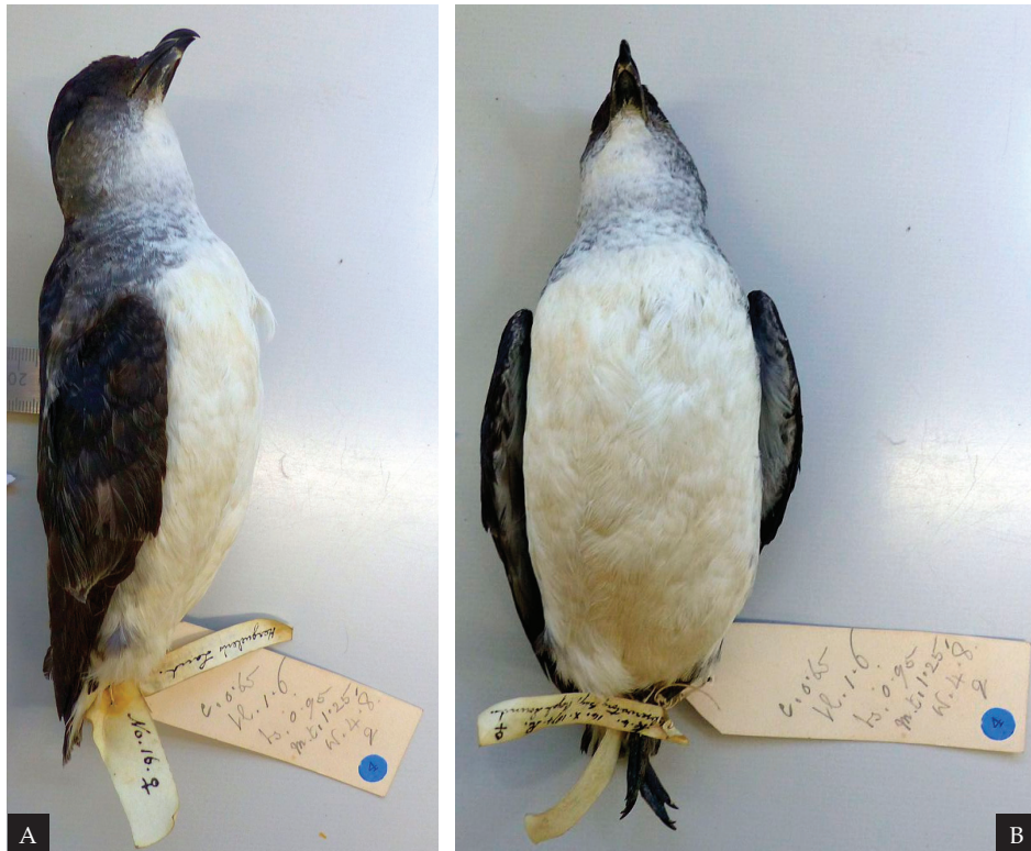
Figure 2. Lateral (A) and ventral (B) views of the lectotype of Pelecanoides u. exsul, NHMUK 1876.4.26.13