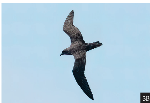
Figures 3A–B. Dark-morph Herald Petrels Pterodroma heraldica , 1.5–3.0 miles off east coast of Ua Pou, Marquesas Islands, French Polynesia, South Pacific, 3 and 5 October 2021 respectively; note slight variation in dorsal coloration, though true colour may be affected by lighting and feather wear (Fig. 3A Mike Danzenbaker, Fig. 3B Kirk Zufelt)