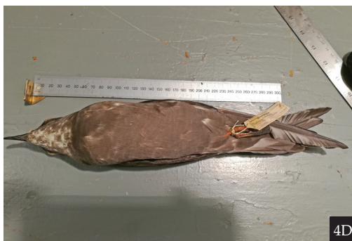
Figures 4A–D. Dark-morph Herald Petrel Pterodroma heraldica specimens at American Museum of Natural History (AMNH). Figure 4A. AMNH 194339 (top), AMNH 194338 (bottom), Ua Pou, Marquesas Islands, South Pacific, 14–15 September 1922. Figure 4B. AMNH 191756, Ducie Atoll, Pitcairn Islands, South Pacific, 30 March 1922. Figure 4C. AMNH 191770, Ducie Atoll, Pitcairn Islands, South Pacific, 30 March 1922. Fig. 4D. AMNH 191592, Ducie Atoll, Pitcairn Islands, South Pacific, 20 March 1922 (also shown in Figs. 5, 6 and 10)

one bird at sea (Fig. 8). General plumage In all respects, the palest intermediates approach light morph, and the darkest approach dark morph. Lower breast to undertail-coverts There is a gradation in plumage from dusky (AMNH 191366, Fig. 6) to darkish (AMNH 191642, Fig. 5), and in between (Fig. 8). The key difference from light morph is that the breast to undertail-coverts are at least wholly dusky (Fig. 6); and from dark morph this area manifests reasonably clear ghosting of light-morph plumage, with a relatively clear border between the dark upper breast and paler lower breast; Fig. 8).