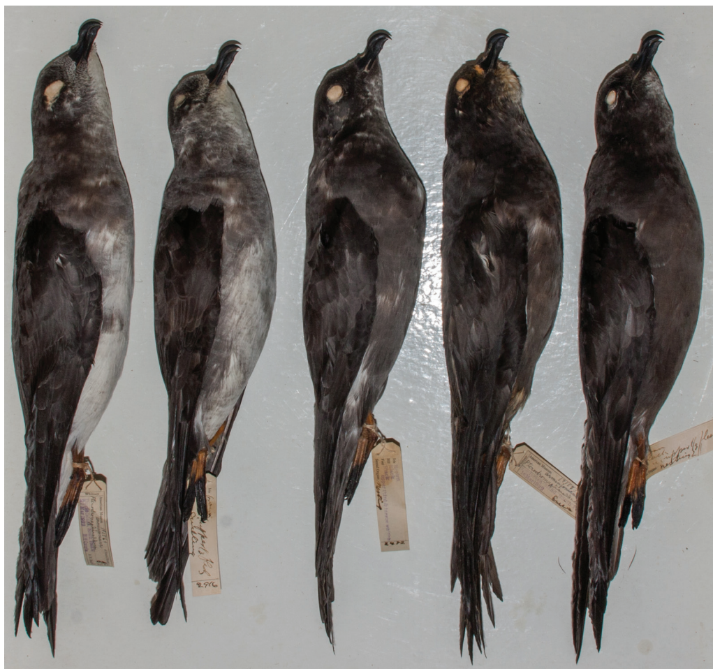
Figure 5. Comparison of light, intermediate and dark-morph Herald Petrels Pterodroma heraldica (left-hand three specimens) with Henderson Petrels P. atrata (right-hand two specimens), at American Museum of Natural History (AMNH), from left to right: (1) light-morph Herald Petrel (AMNH 191569), Ducie Atoll, Pitcairn Islands, South Pacific, (2) intermediate-morph Herald Petrel (AMNH 191642), Henderson Island, Pitcairn Islands, South Pacific, (3) dark-morph Herald Petrel (AMNH 191592, also shown in Figs. 4D, 6, 10), Ducie Atoll, Pitcairn Islands, South Pacific, 20 March 1922, (4) Henderson Petrel (AMNH 191753), Henderson Island, Pitcairn Islands, South Pacific, (5) Henderson Petrel (AMNH 191553), Henderson Island, Pitcairn Islands, South Pacific; note that (1) is a typical light-morph Herald Petrel, (2) an intermediate-morph Herald Petrel with a complete dark-flecked dusky lower breast to undertail-coverts, (3) a typical dark-morph Herald Petrel, and (4) and (5) are typical Henderson Petrels (Tubenoses Project/Hadoram Shiriha)