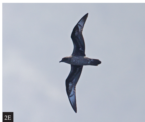
Figures 2A–E. Five dark-morph Herald Petrels Pterodroma heraldica , off Ua Pou, Marquesas Islands, French Polynesia, South Pacific, 1–5 October 2021; Fig. 2C taken over submerged atoll Guyot Kena, c.17 miles south-east of Ua Pou at 09°35'20.4"S, 139°46'30"W, all others 1.5–3.0 miles off east coast of Ua Pou. Each of following pairs of figures shows one bird: Figs. 1 and 2D, Figs. 2A and 9, and Figs. 2B and 3A. The individuals show slight variation in the extent of white basally in the primaries and greater primary-coverts, and paleness of the underparts (latter affected by lighting). However, without exception, the white basal primary panels are large and pronounced, which alone separates dark-morph Herald Petrel from Henderson Petrel P. atrata with its 'all-dark' underwing (Fig. 11A–B)

subtle ghosting of light morph plumage, suggesting intermediate morph (e.g., Figs. 2A and 9 show same bird under different lighting conditions, Fig. 9 suggesting intermediate morph).