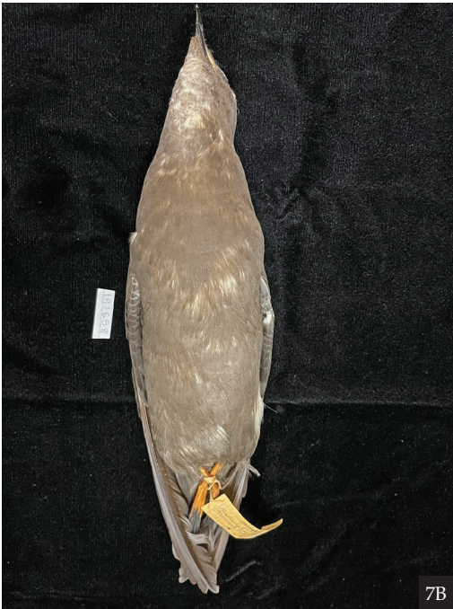
Figure 7A–B. Dark-morph Herald Petrels Pterodroma heraldica , collected in Tuamotu Islands, on Vanavana Island (AMNH 191656; left) and Tenarunga Island (AMNH 191658; right)