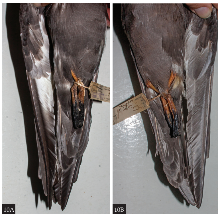
Figure 10A–B. Dark-morph Herald Petrel Pterodroma heraldica (Fig. 10A), Ducie Atoll, Pitcairn Islands, South Pacific (AMNH 191592, also Figs. 4D, 5–6); Henderson Petrel P. atrata (Fig. 10B, also Fig. 5), Henderson Island, Pitcairn Islands, South Pacific (AMNH 191753). Note, dark-morph Herald Petrel shows a white tongue basally on inner web of underside to primaries (only p10 visible here) and white basally in greater primary-coverts (outermost few visible here), both of which are dark in Henderson Petrel (though white basally on greater primary-coverts can be just visible; as here, be aware of light reflecting off the underside of the primaries)