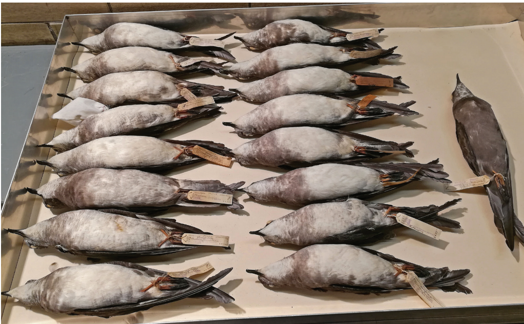
Figure 6. Herald Petrel Pterodroma heraldica specimens, Ducie Atoll, Pitcairn Islands, South Pacific. Light morphs, except intermediate morph AMNH 191366 (left row, third from bottom, collected 20 March 1922), and dark morph AMNH 191592 (far right, collected 20 March 1922, also shown in Figs. 4D, 5 and 10). Note, some light morphs have dusky markings encroaching onto the belly (e.g., left row, second from bottom), but in our definition the intermediate morph uniquely has a complete dusky lower breast to undertail-coverts, plus an enlarged diffuse dark breast-band