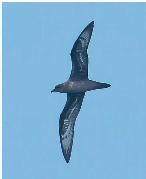
Figure 8 (left). Intermediate-morph Herald Petrel Pterodroma heraldica , 1.5–3.0 miles off east coast of Ua Pou, Marquesas Islands, French Polynesia, South Pacific, 5 October 2021; breast to undertail-coverts darkish with a quite clear ghosting of light-morph plumage (e.g., clearly delineated border between darker upper breast and paler lower breast). Multiple photographs were checked to eliminate the possibility that this is an effect of lighting (cf. Fig. 9). (Shoko Tanoi)