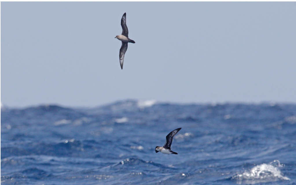
Figure 1. Light-morph (bottom) and dark-morph (top) Herald Petrels Pterodroma heraldica , c.1.5 miles off east coast of Ua Pou, Marquesas Islands, French Polynesia, South Pacific, 5 October 2021; the dark morph shows the same basic underwing pattern as the light morph, whilst Fig. 2D shows the same dark morph

due to a lack of confirmatory photographs, although they stated that ‘At-sea observations indicate that, unlike Henderson Petrel, some presumed dark-morph Heralds have white underwing primary flashes, like light-morph Herald, and a greyish ground colour to the plumage (H. Shirihi, pers. comm.).’ Bailey et al. (1989), Marchant & Higgins (1990) and Harrison et al. (2021) illustrated this plumage, but Bailey et al. did not distinguish Henderson Petrel from Herald Petrel and presented both underwing plumages as variation within Herald Petrel.