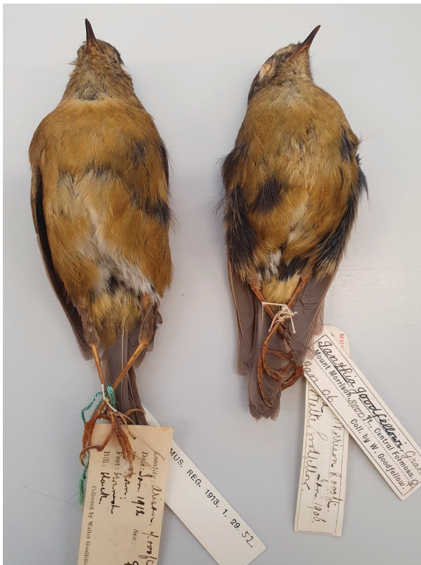
Figure 2. Female syntypes of Ianthia goodfellowi (a synonym of White-browed Bush Robin T. indicus formosanus) (NHMUK 1913.1.29.52; left; for collection details, see main text) and Collared Bush Robin Tarsiger johnstoniae (NHMUK 1907.12.12.40; for collection details, see Fig. 1), showing their identically coloured undertail-coverts