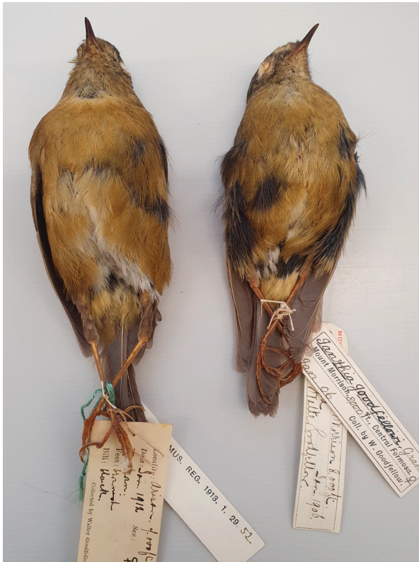
Figure 2. Female syntypes of Ianthia goodfellowi (a synonym of White-browed Bush Robin T. indicus formosanus) (NHMUK 1913.1.29.52; left; for collection details, see main text) and Collared Bush Robin Tarsiger johnstoniae (NHMUK 1907.12.12.40; for collection details, see Fig. 1), showing their identically coloured undertail-coverts