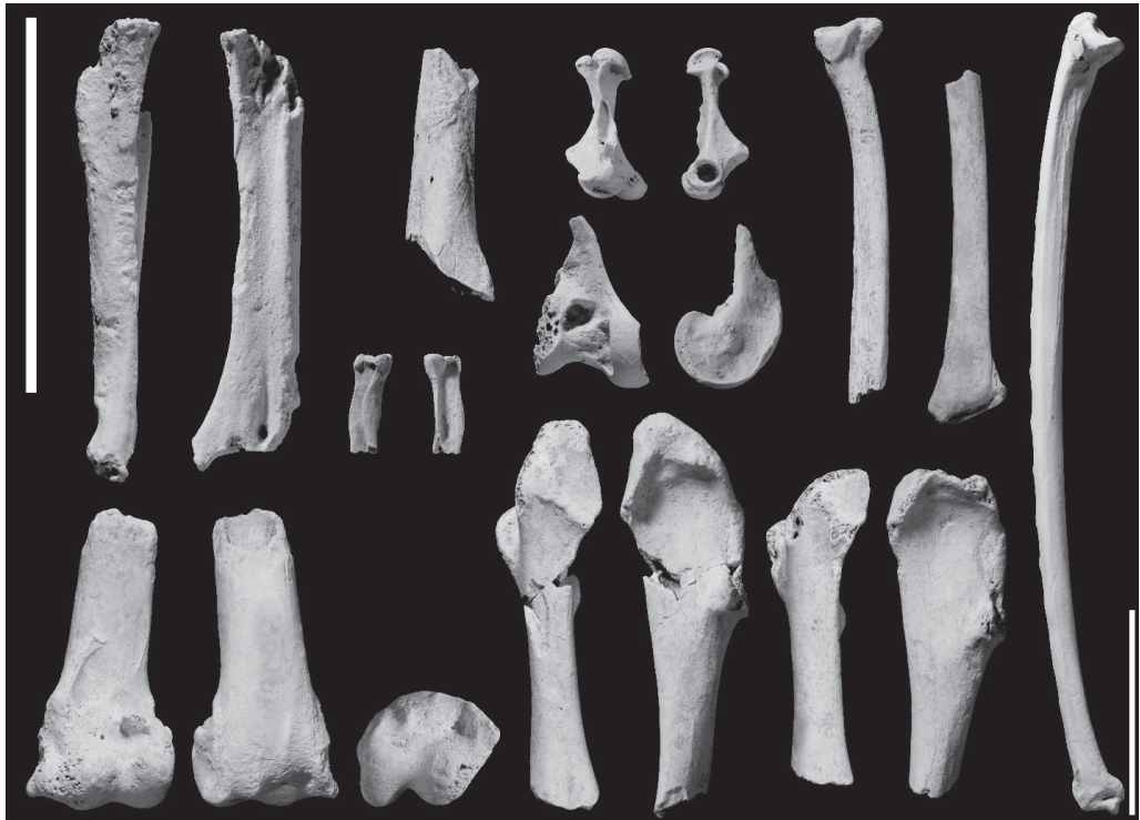
Figure 9. Osteological specimens of Spectacled Cormorant Urile perspicillatus in the National Museum of Science and Nature, Tsukuba Research Centre, Tsukuba, Japan (NSM PV 24191); note the differing scale for the ulna (right; both scale bars equal to 50 mm)

Fossil material from Pleistocene deposits around Shiriya, Japan was collected in the 1970s and identified as various cormorant specimens in the 1980s. The materials were rechecked by Watanabe et al. (2018) and found to contain 13 elements of Spectacled Cormorant (NSM PV 24191 and others; Fig. 9) indicating a much wider historical distribution for the species.