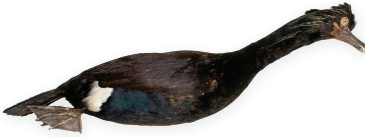
Figure 3 (top). Spectacled Cormorant Urile perspicillatus skin in the collection of the Zoological Institute of the Russian Academy of Sciences, St. Petersburg (ZISP 137178)