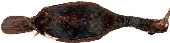
Figure 8. Unmounted skin of Spectacled Cormorant Urile perspicillatus in the Natural History Museum, Tring (NHMUK 1858.2.3.1)