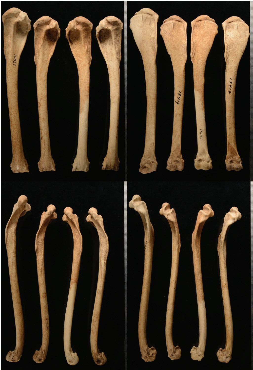
Figure 10. Humeri from Spectacled Cormorants Urile perspicillatus in the National Museum of Natural History, Washington, DC (USNM 17041 and USNM 19417); scale bars in mm