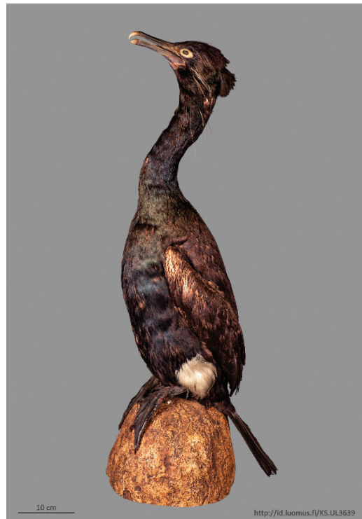
Figure 1. Spectacled Cormorant Urile perspicillatus mount at the Finnish Museum of Natural History, Helsinki (MZH UK 3639) (full record at http://id.luomus.fi/GZ.18079 ).

According to Palmgren (1935) the skin held in Helsinki (MZH UL 3639; Fig. 1) was either acquired directly by naturalist Reinhold Ferdinand Sahlberg (1779–1860) during a trip to Sitka between 13 May 1840 and 15 May 1841 (Palmgren 1935) or via the Zoological Institute of the Russian Academy of Sciences (Neufeldt 1978). Sahlberg reportedly had good relations with