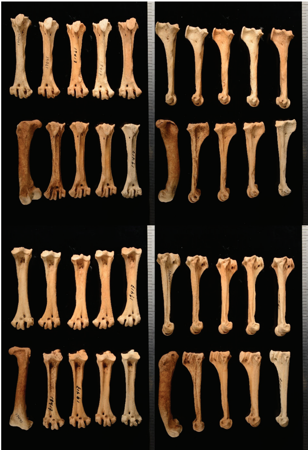
Figure 12. Femur and tarsometatarsi from Spectacled Cormorants Urile perspicillatus in the National Museum of Natural History, Washington, DC (USNM 17041 and USNM 19417); scale bars in mm