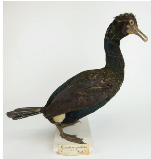
Figure 2. Spectacled Cormorant Urile perspicillatus mount at the Naturalis Biodiversity Center, Leiden (RMNH.AVES.107865)

This specimen (RMNH.AVES.107865; Fig. 2) was received from the Zoological Institute of the Imperial (now Russian) Academy of Sciences in the mid-1800s and noted to have origins in Sitka (Schlegel 1863), but the circumstances of its receipt are unclear and nothing is known of its arrival in Europe (P. Kamminga in litt. 2022). What appears to be an original specimen tag notes both the museum in St. Petersburg and the town of 'Sitka' (as opposed to Novo-Arkhangelsk or New Archangel) as origins of the skin, however because the transfer happened before Russian Alaska became part of the USA this may have been an updated tag from some time afterwards. Later publications concur in this specimen being a transfer from the Russian Academy of Sciences (see below; Stejneger & Lucas 1889, Hume 2017). The specimen is mounted upright on a raised white wooden board and appears in fair shape with some clear discoloration all over. The occipital crests are essentially indistinguishable. The bill appears particularly frail and the tail feathers are worn.