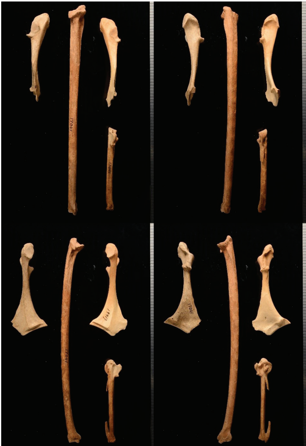
Figure 11. Left and right coracoid, carpometacarpus, and ulna from Spectacled Cormorants Uria perspicillatus in the National Museum of Natural History, Washington, DC (USNM 17041 and USNM 19417); scale bars in mm