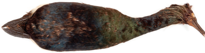
Figure 7. Unmounted skin of Spectacled Cormorant Urile perspicillatus in the Natural History Museum, Tring (NHMUK 1842.12.21.4)