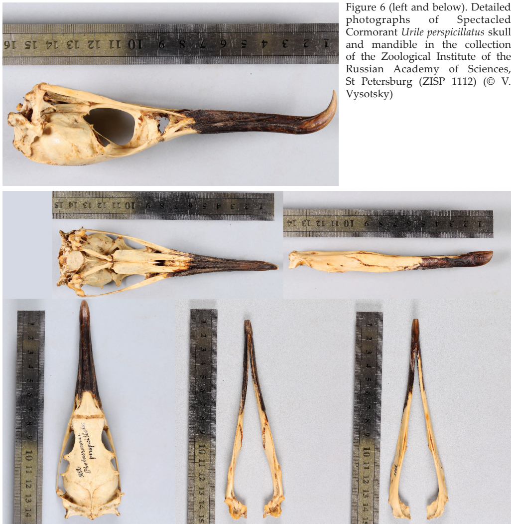
Figure 6 (left and below). Detailed photographs of Spectacled Cormorant Urile perspicillatus skull and mandible in the collection of the Zoological Institute of the Russian Academy of Sciences, St Petersburg (ZISP 1112)

good skin integrity, especially around the eyes. The feathers of the double crest remain clear and many pale yellow facial plumes are present.