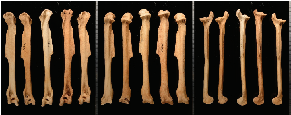
Figure 13. Tibiotarsi from Spectacled Cormorants Urile perspicillatus in the National Museum of Natural History, Washington, DC (USNM 17041); scale bars in mm