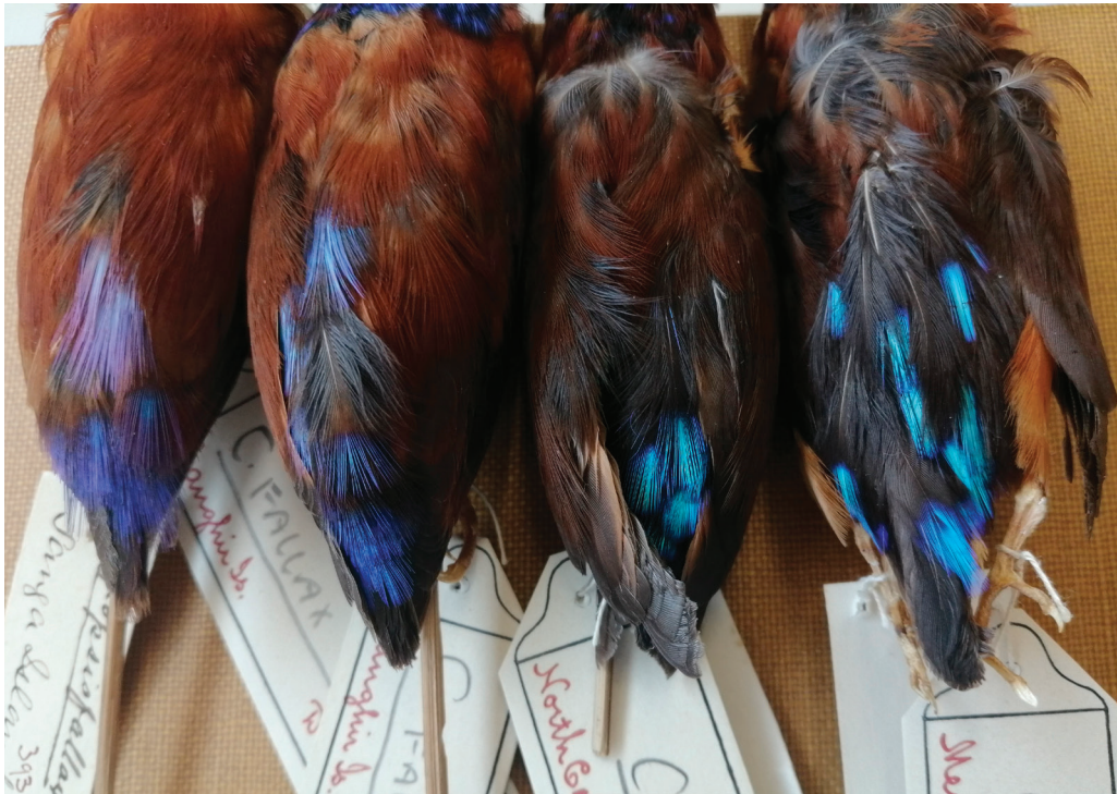
Figure 6. Upperparts (left to right) of Sangihe Dwarf Kingfisher Ceyx sangirensis (NHMUK 1888.10.20.393, adult, and 1888.10.20.392, juvenile) and Sulawesi Dwarf Kingfisher C. fallax (NHMUK 1888.10.20.391, adult, and 1888.10.20.390, juvenile), the two former showing the cobalt or royal blue of the uppertail-coverts with little or none of the bright metallic turquoise-blue feathering of the two latter (note the lighter dorsal area of the two former)

Eight (mounted) syntypes (Fig. 11), four mounted specimens (Fig. 12) and eight study skins of C. fallax (Fig. 13) in Naturalis—the 15 evident adults amongst which were measured for Table 2—all show shining pale turquoise-blue streaks in the lower dorsal and rump feathers. Thus it can be said with confidence that the proportion of cobalt-blue on these areas is significantly greater in sangirensis than in fallax . A further consideration is that the white on the throat of sangirensis cuts off rather sharply at the upper breast, whereas in fallax it overruns with softer edging onto the top of the breast (Figs. 2 and 14–16).