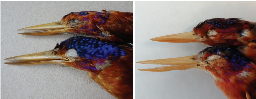
Figure 3 (left). Syntype of Sangihe Dwarf Kingfisher Ceyx sangirensis (NMW 35170), below, next to a specimen of Sulawesi Dwarf Kingfisher C. fallax (NMW 50522), in lateral upper body view, showing the longer bill and much more extensive black crown with larger blue spangling (N. J. Collar)