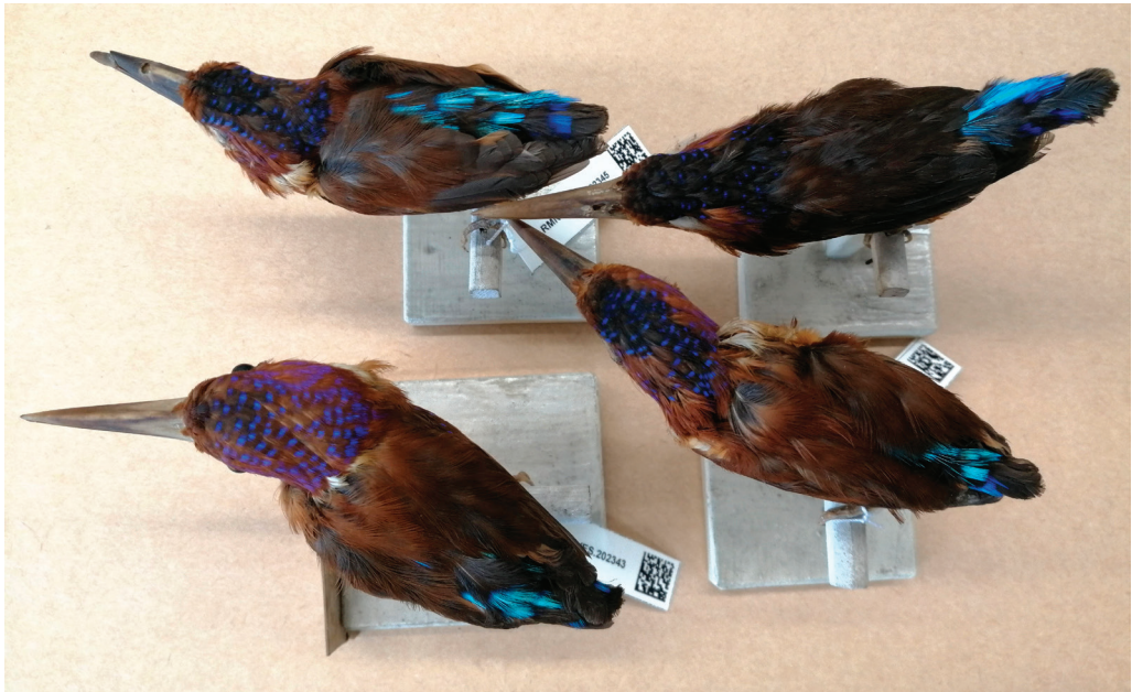
Figure 12. Four mounted specimens of Sulawesi Dwarf Kingfisher Ceyx fallax in Naturalis Biodiversity Center, Leiden, showing the prevalence of bright electric blue feathers on the rump and uppertail-coverts (N. J. Collar)