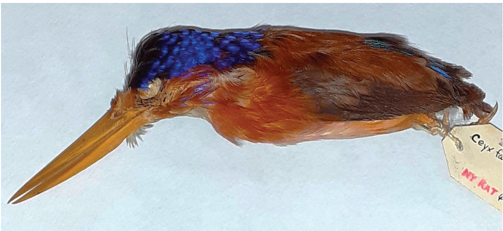
Figure 9 (below). Male Sangihe Dwarf Kingfisher Ceyx sangirensis (ZMUC 60.029), lateral view (Povl Jørgensen)