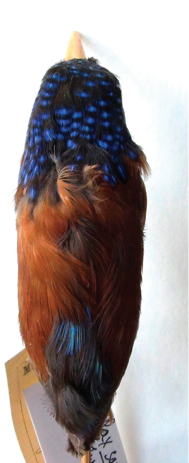
Figure 7 (left). Male Sangihe Dwarf Kingfisher Ceyx sangirensis (ZMUC 60.029), dorsal view Figure 8 (right). Male Sangihe Dwarf Kingfisher Ceyx sangirensis (MNHN-ZO-MO-1991-693), dorsal view. Both images show a broadly blue-spangled black crown and lack bright turquoise feathers in the rump and uppertail-coverts.