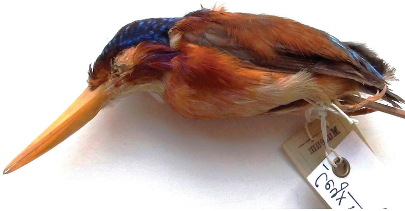
Figure 10. Male Sangihe Dwarf Kingfisher Ceyx sangirensis (MNHN-ZO-MO-1991-693), lateral view (flipped for easier comparison with Fig. 9) (Patrick Boussès)