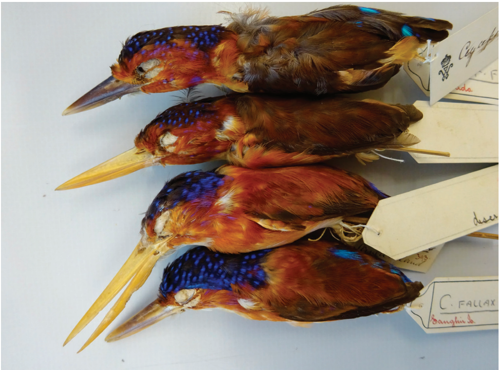
Figure 5. Top to bottom: Sulawesi Dwarf Kingfisher Ceyx fallax (NHMUK 1888.10.20.390, juvenile, and 1888.10.20.391, adult) and Sangihe Dwarf Kingfisher C. sangirensis (NHMUK 1888.10.20.393, adult, and 1888.10.20.392, juvenile); note the more extensive blue crowns of C. sangirensis and, in this sample (but see text and Fig. 1), their brighter, lighter upperparts

bill shape in the original description of sangirensis could not be judged with any confidence and was set aside from further consideration.