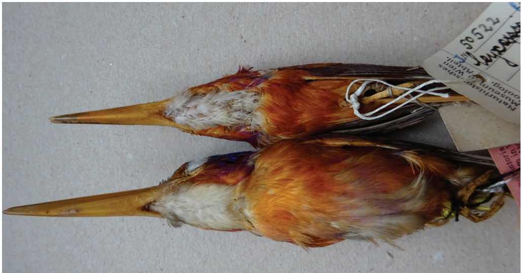
Figure 2. Syntype of Sangihe Dwarf Kingfisher Ceyx sangirensis (NMW 35170), below, next to a specimen of Sulawesi Dwarf Kingfisher C. fallax (NMW 50522), in ventral view, showing the longer bill and (in this comparison) slightly more constrained white throat, not extending onto the upper breast

and rump of the adult is a magenta- or mauve-washed pale blue, shading to royal blue or cobalt on the uppertail-coverts, while the juvenile has the lower back and rump mainly dull turquoise-blue, again shading to cobalt on the uppertail-coverts (Figs. 4–6, Tables 1–2). By contrast the two NHMUK specimens of fallax have broad streaks of shining pale turquoise-blue from the rump to uppertail-coverts, with only the tips of the latter shading to blue (Figs. 5–6). The Copenhagen and Paris specimens of sangirensis validate the diagnostic characters enumerated here, showing very slight tints of mauve or magenta and lacking the shining pale turquoise-blue on the rump (Figs. 7–10). The somewhat recondite point about