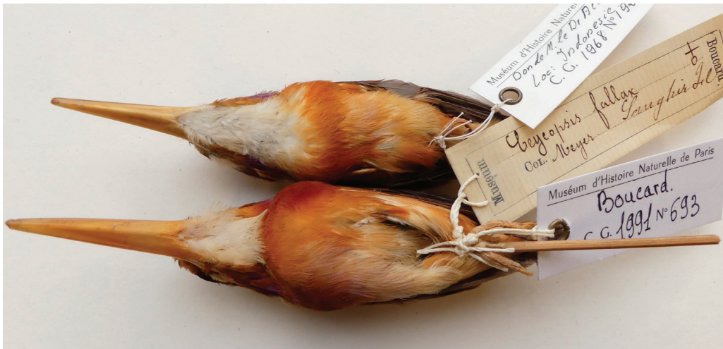
Figure 15. Specimen of Sangihe Dwarf Kingfisher Ceyx sangirensis (MNHN-ZO-MO-1991-693), below, with one Sulawesi Dwarf Kingfisher Ceyx fallax (MNHN-ZO-MO-1968-192), showing the greater bill length of the former and the sharper cut-off white throat above the upper breast

Using the Tobias criteria (see Tobias et al. 2010, del Hoyo & Collar 2014: 30–40) we would revise the scores for the diagnostic characters of sangirensis as: distinctly longer