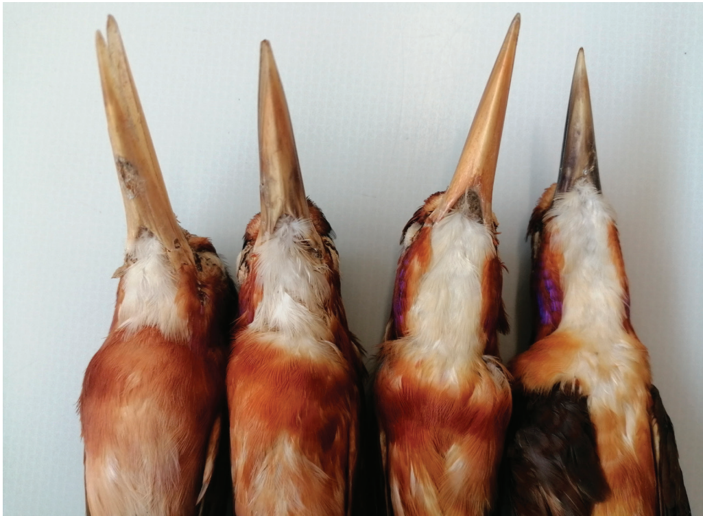
Figure 14. Upper underparts (left to right) of Sangihe Dwarf Kingfisher Ceyx sangirensis (NHMUK 1888.10.20.393, adult, and 1888.10.20.392, juvenile) and Sulawesi Dwarf Kingfisher C. fallax (NHMUK 1888.10.20.391, adult, and 1888.10.20.390, juvenile), the two former showing the less extensive white throat than in the two latter