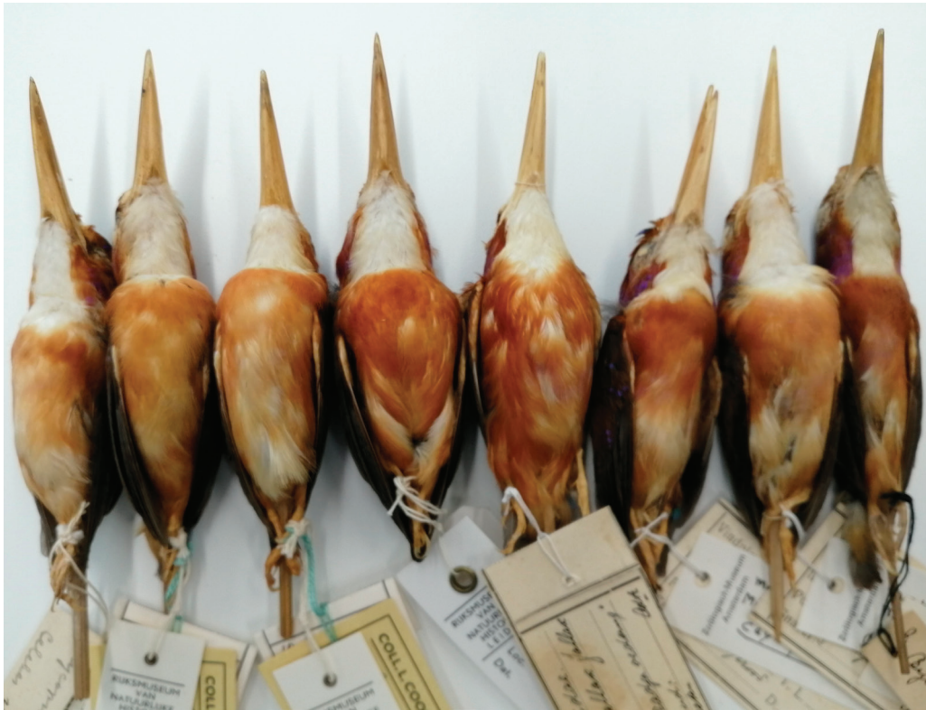
Figure 16. Eight study skins of Sulawesi Dwarf Kingfisher Ceyx fallax in Naturalis Biodiversity Center, Leiden (same birds as in Fig. 13), to show that the white of the throat extends onto the upper breast in most (and probably all) of the specimens (N. J. Collar)