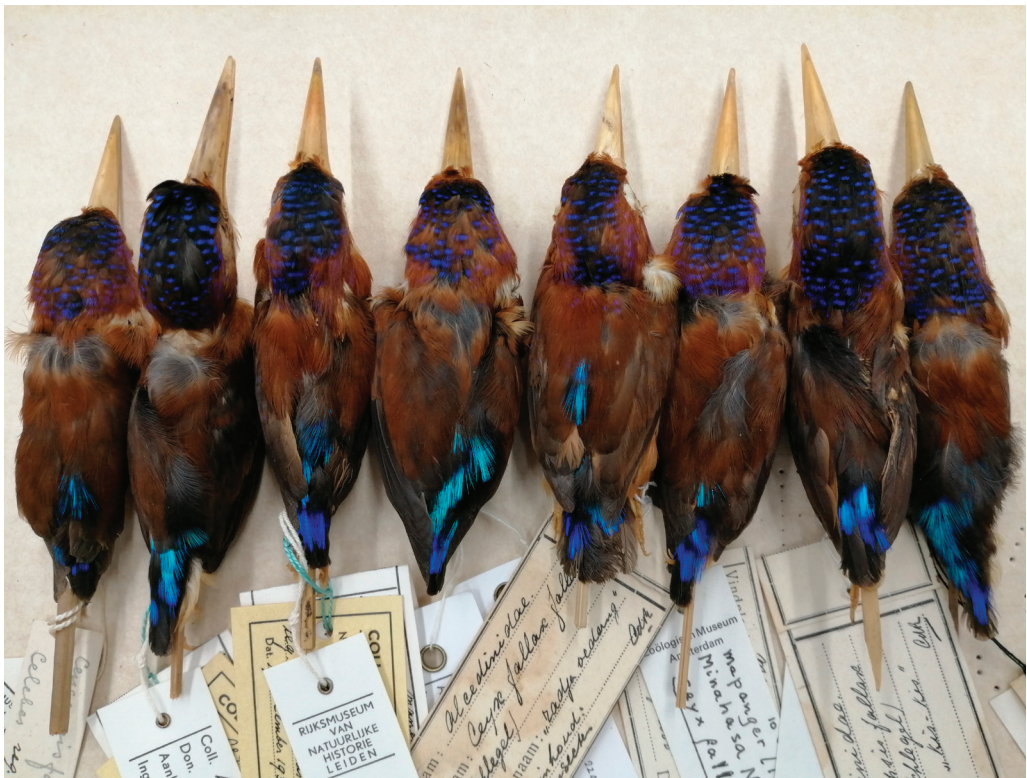
Figure 13. Eight study skins of Sulawesi Dwarf Kingfisher Ceyx fallax in Naturalis Biodiversity Center, Leiden, showing the prevalence of bright electric blue feathers on the rump and uppertail-coverts (N. J. Collar)