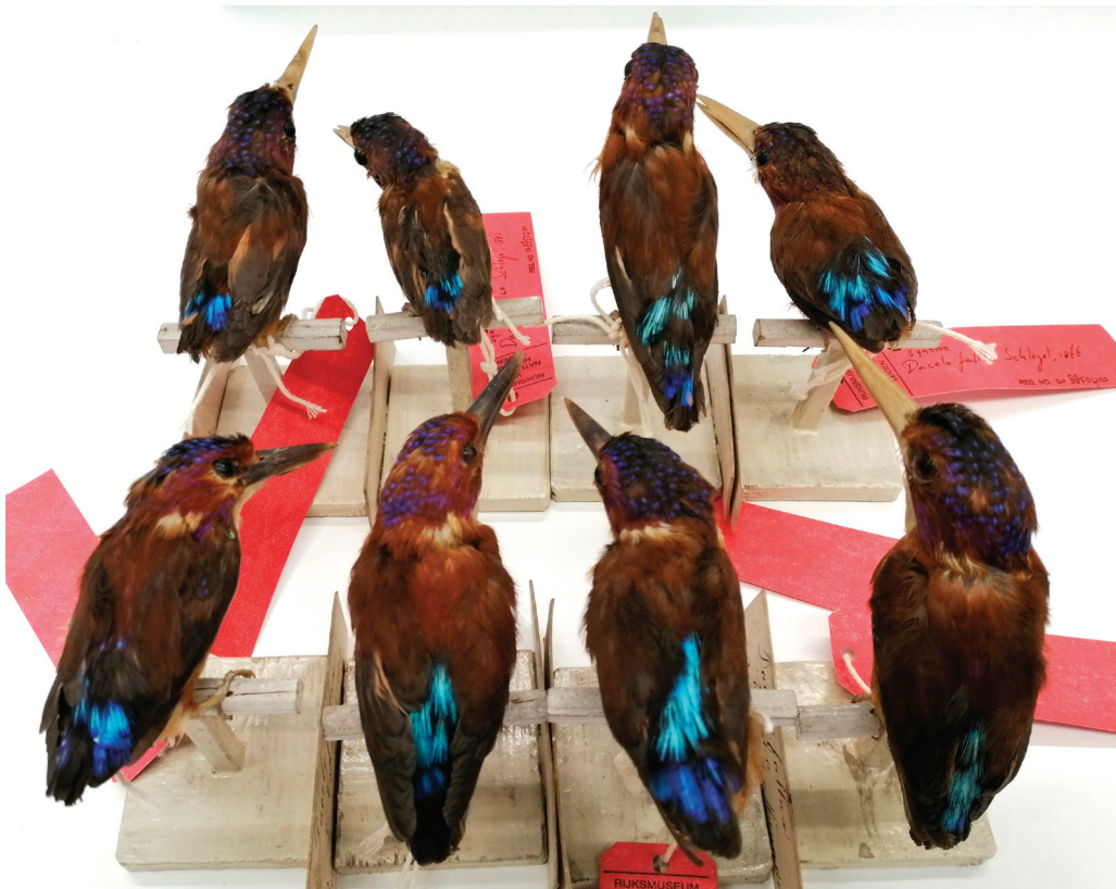
Figure 11. Eight syntypes of Sulawesi Dwarf Kingfisher Ceyx fallax in Naturalis Biodiversity Center, Leiden, showing the prevalence of bright electric blue feathers on the rump and uppertail-coverts

35.3 and 35.1 mm [ P = 0.80 ], wing 56.8 and 57.7 mm [ P = 0.11 ], tail 20.9 and 21.1 mm [ P = 0.65 ], respectively). Inspection of all material was undertaken by NJC, with measurements of bill (tip to skull), wing (curved) and tail (tip to point of insertion) taken using digital callipers. Comparisons between the five sangirensis and 39 fallax specimens indicate that the bill of the former is 13% longer than that of the latter (rather more than the 10% suggested by Fry et al. 1992); neither this nor the tail shows overlap with fallax (Table 2).