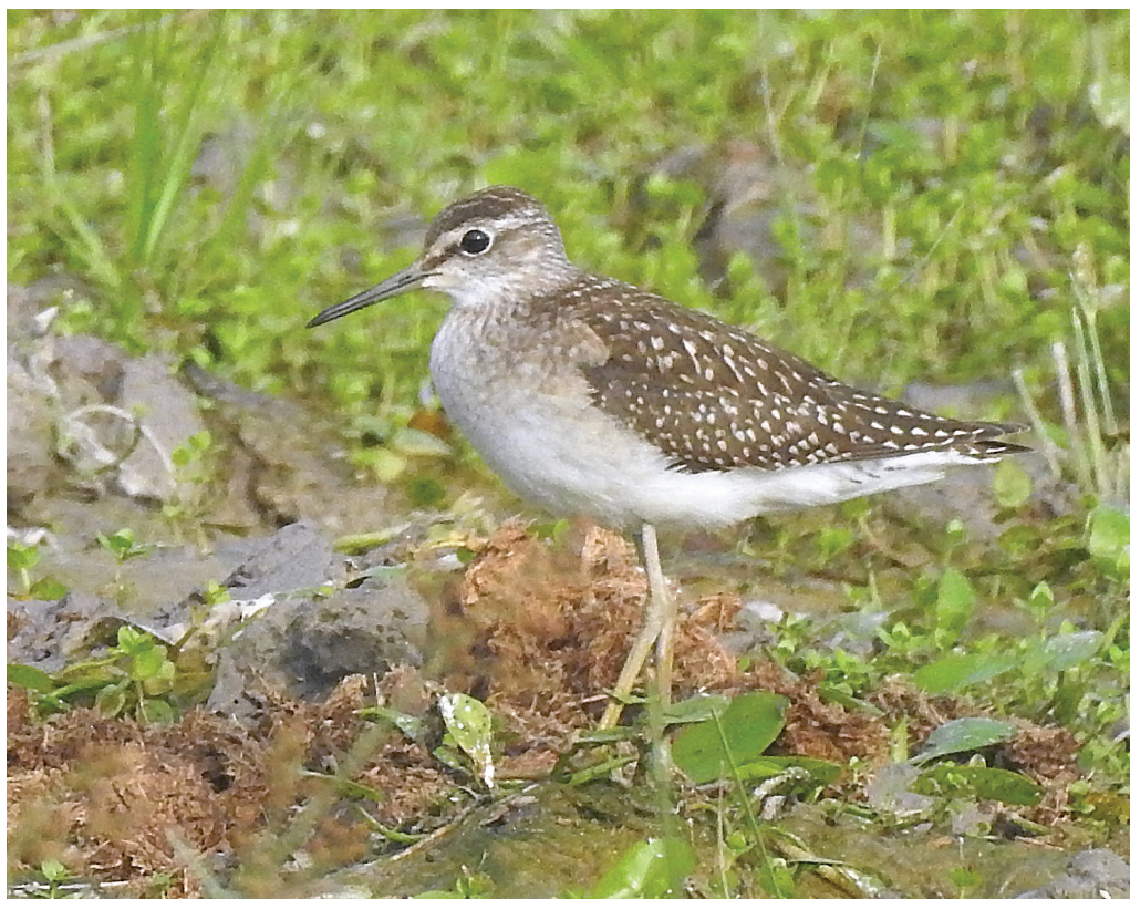
Figure 2. First-year Wood Sandpiper Tringa glareola , Montsinéry-Tonnégrande, French Guiana, 13 September 2019; note the long, prominent white supercilium reaching behind the eye, densely speckled upperparts, yellowish-green legs and diffusely spotted breast (indicating a first-year) (Olivier Tostain)

On 11 September 2019, a first-year was photographed (Figs. 2–3) by PL feeding in wet pastures at Lambert equestrian centre, Montsinéry-Tonnégrande (04°52'58"N, 52°31'19"W). These pastures, still partially flooded at the start of the dry season, were highly attractive to migrant waders. Over a few weeks, 13 species were observed there including American Golden Plover Pluvialis dominica and Pectoral Sandpiper Calidris melanotos . The Tringa stayed at least three days, being seen again on 13 September by HF, PL & OT. There were no attempts to find it again thereafter and the site is known to have quickly dried out.