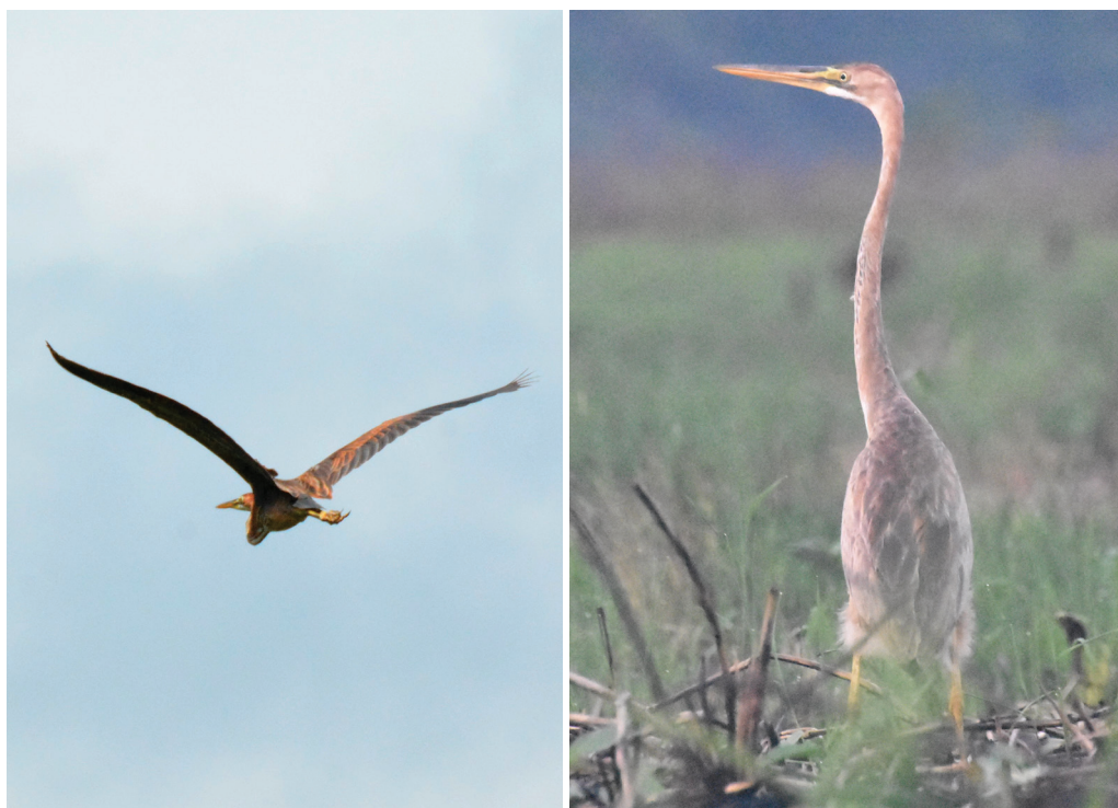
Figure 10 (left). Subadult Purple Heron Ardea purpurea , Regina, Kaw-Roura National Nature Reserve, French Guiana, 29 May 2018; note the pale upperwing-coverts indicating a subadult (Benjamin Ferlay)

On 26 April 2019, a second-year was photographed (Fig. 12) in rice fields at Mana on the west coast of French Guiana (05°38'27"N, 53°40'59"W) by GC. The bird was foraging along a canal, probably on crabs, when it was flushed by GC. During the following days, several observers failed to find the bird in this vast and largely inaccessible area, but given the suitability of the habitat it is possible that the bird was still present. On 8 January 2023, an adult in basic plumage (Fig. 13) was photographed by C. Marty & A. Vinot in a regularly surveyed flooded pasture along the Guatemala Road near Kourou (05°06'14"N, 52°35'02"W). The bird was seen several times at the same location feeding on frogs, and was last reported on 12 January (M. Baumann, HF, T. Ferrieux & OT). Less than three months later, on 2 March 2023, an adult in nearly alternate plumage was photographed by I. Morisset at Panato wetland, Awala-Yalimapo (05°44'30"N, 53°55'54"W); it was photographed (Fig. 14) again next day by M. Baumann & GC. This site is c.160 km west of