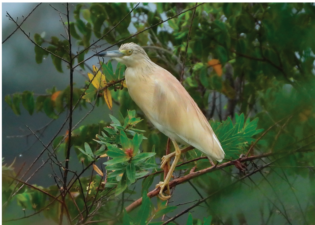
Figure 14. Adult Squacco Heron Ardea ralloides coming into alternate plumage, Panato wetland, Awala-Yalimapo, French Guiana, 3 March 2023

where the individual was seen in January, but it is possible that the two records involved the same bird that had moulted in French Guiana.