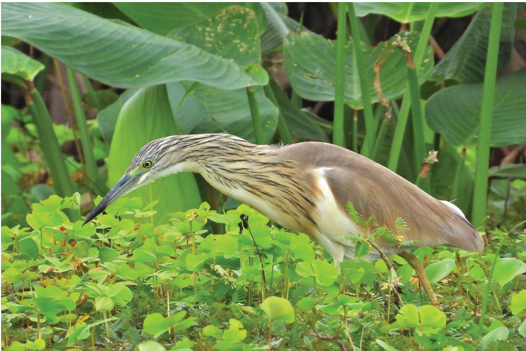
Figure 13. Adult Squacco Heron Ardea ralloides in basic plumage, Guatemala road, Kourou, French Guiana, 12 January 2023 (Olivier Tostain)