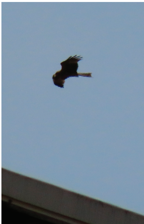
Figure 17. Probable adult Yellow-billed Kite Milvus aegyptius , Cayenne, French Guiana, 3 May 2023; note adult-type yellow bill distinguishing it from Black Kite M. migrans and the slightly forked tail (Hugo Foxonet)

This record is almost certainly the first documented Yellow-billed Kite in the New World; when treated as a subspecies of Black Kite, it is the sixth record for South America and the first Afrotropical taxon recorded in French Guiana (CHG 2024).