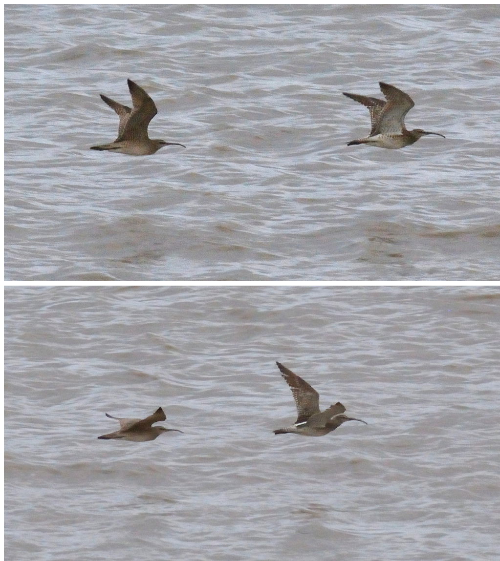
Figures 4–5. Eurasian Whimbrel Numenius phaeopus phaeopus (right) with Hudsonian Whimbrel N. p. hudsonicus , Pointe des Amandiers, Cayenne, French Guiana, 28 April 2020; note the pale underwing-coverts contrasting with brown underwing-coverts of hudsonicus and white rump continuing onto the back (Olivier Tostain)

same site, OC, LK & OT photographed what was probably the same individual, both times being identified by the white rump and white underwing-coverts via direct comparison with Hudsonian Whimbrel (Skeel & Mallory 2020).