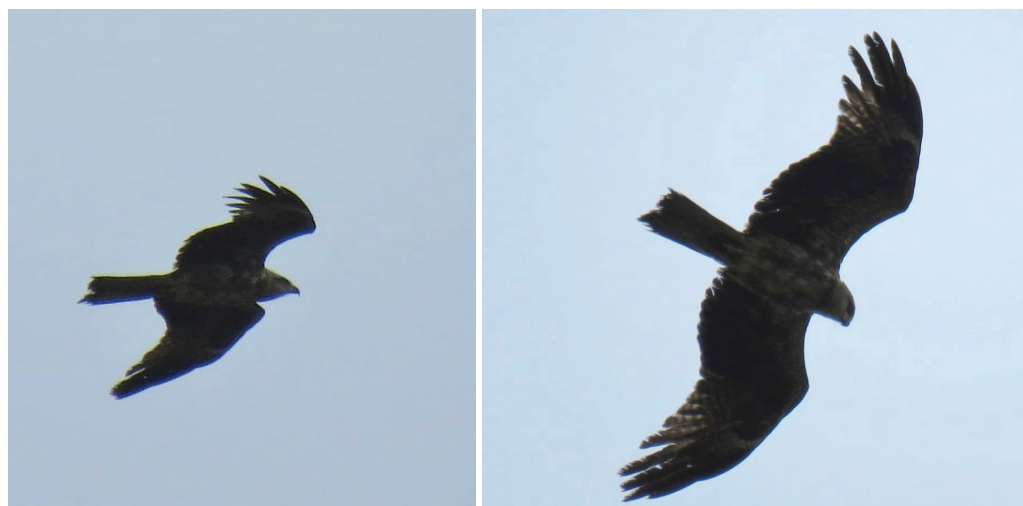
Figures 15–16. Probable second-year Black Kite Milvus migrans , Iles du Salut, Kourou, French Guiana, 10 May 2018; note worn plumage without visible forked tail, pale greyish head, black bill contrasting with yellow cere, dirty streaked belly (suggesting a second-year) and pale area at the base of the primaries (Quentin d'Orchymont)

Other records have been documented in the West Indies, in the Bahamas, Dominica, Guadeloupe, Barbados, Grenada (K. Carter, https://ebird.org/checklist/S93838051 ) and the British Virgin Islands (Norton 2000, Buckley et al. 2009, Kirwan et al. 2019; A. Levesque in litt. 2022).