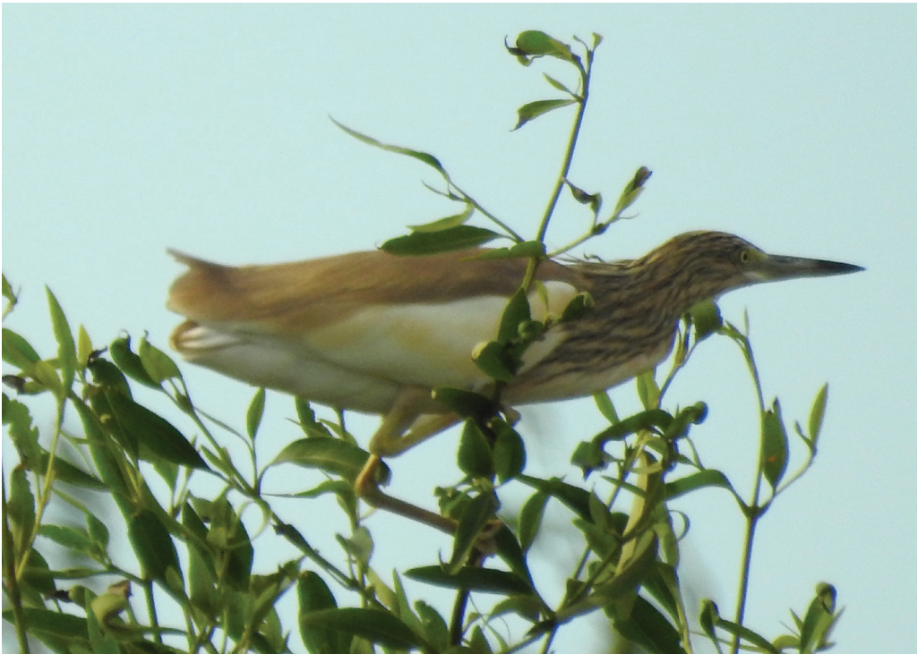
Figure 12. Second-year Squacco Heron Ardea ralloides , Mana, French Guiana, 26 April 2019; note the large streaks on the head and neck and fairly dark mantle indicating a second-year