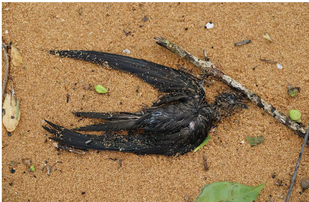
Figure 1. Common Swift Apus apus found dead on Montabo beach, Cayenne, French Guiana, 25 December 2021 (Jean-François Szpigel)

Common Swift is a Eurasian species that winters in Africa south of the equator (Chantler et al. 2020). This is the third record for South America. The first was of an individual