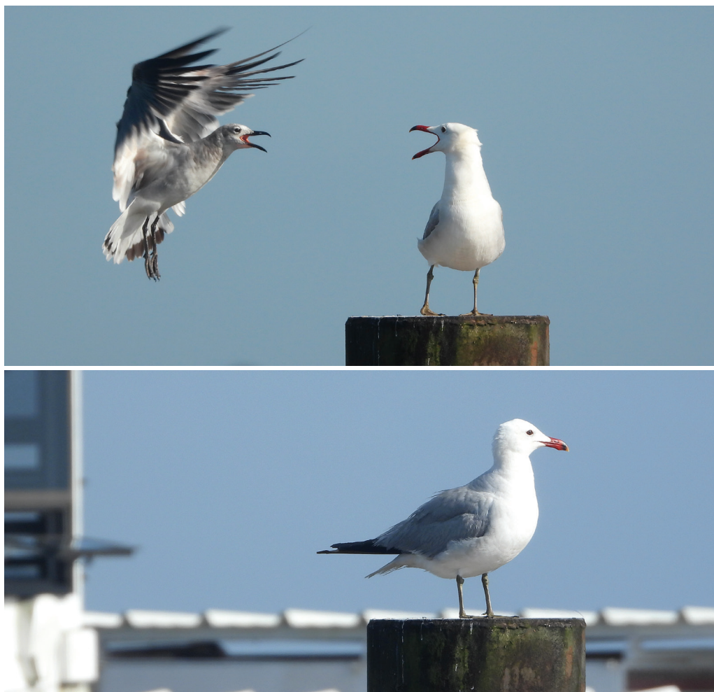
Figures 8–9. Adult Audouin's Gull Ichthyaelus audouinii , Saint-Laurent-du-Maroni, French Guiana, 29 March 2023; note the elegant, pale appearance, red bill, dark eye and olive-grey legs typical of this species

2023), Lesser Black-backed Gull Larus fuscus (GEPOG 2023), Common Gull L. canus (Rufraý et al. 2019) and White-winged Tern Chlidonias leucopterus (Rufraý et al. 2019, GEPOG 2023).