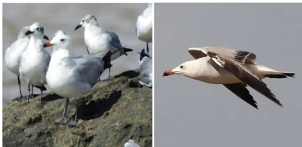
Figures 6–7. Third-year Audouin's Gull Ichthyæetus audouinii , Pointe de la Roche Bleue, Saint-Laurent-du-Maroni, French Guiana, 28 January 2021; note the red-and-black bicolored bill, dark primaries, tertials and patterned upperparts indicating a third-year (Grégory Cantaloube)

Audouin's Gull is the 28th species of Laridae recorded in French Guiana (CHG 2024) and the fifth from the Palearctic after Black-headed Gull Chroicocephalus ridibundus (GEPOG