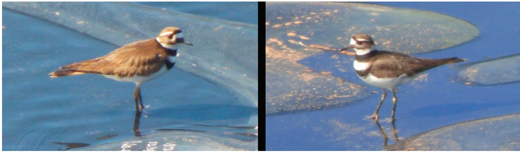
Figure 2. Killdeer Charadrius vociferus , municipality of Ceará-Mirim, Rio Grande do Norte, Brazil, 18 April 2022 (Jorge B. Irusta)

In addition to the state checklist for Rio Grande do Norte (Sagot-Martin et al. 2020) and the references mentioned above, I have also found no suggestion that Killdeer has occurred in Brazil in the citizen science websites, eBird ( https://ebird.org ; as of 18 March 2024), Xeno-canto ( https://xeno-canto.org ; 20 October 2023), Wikiaves ( https://www.wikiaves.com.br ; 20 October 2023) and iNaturalist ( https://www.inaturalist.org ; 18 March 2024). Mine therefore is the first record in Brazil and the southernmost on the Atlantic coast of South America. The closest geographical report of the species is in French Guiana, c.2,300 km to north-west, an undocumented (i.e. hypothetical) record in 2009 (Claessens 2017).