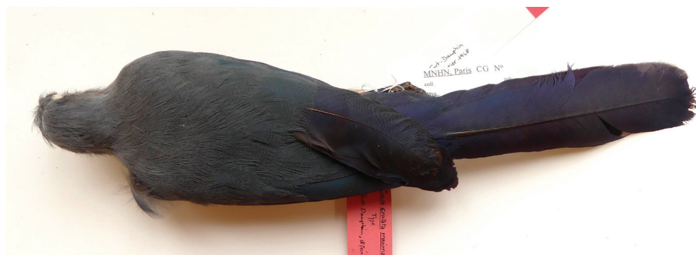
Figure 3. Holotype of Coua cristata maxima (MNHN-ZO-1950-392) in dorsal view (Guy M. Kirwan)