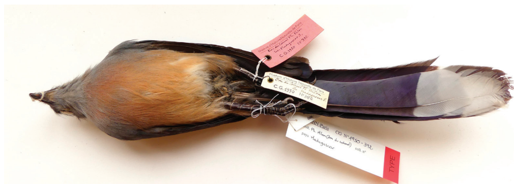
Figure 1. Holotype of Coua cristata maxima (MNHN-ZO-1950-392) in ventral view; note the loss of all undertail-coverts (Guy M. Kirwan)

which he collected at Fort Dauphin (now Taolagnaro or Tolagnaro), in far south-east Madagascar, on 18 February 1948 (Milon 1950); he later mentioned that he found it in humid forest (Milon 1952). He diagnosed it (in French; all quotations from the original description are our translations) on the basis of both size and colour. As its name indicates, the holotype in the Muséum national d'Histoire naturelle, Paris (MNHN-ZO-1950-392; Figs. 1–5), proved larger than the largest of the known subspecies of Crested Coua C. c. pyropyga (in the following sequence of measurements, in millimetres, maxima is first vs. pyropyga , with the latter's values expressed as means of 14 specimens): bill (from commissure) 30.0