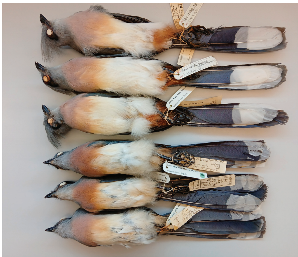
Figure 11. Ventral view of three Coua [cristata] pyropyga and three C. c. cristata specimens in the Natural History Museum, Tring, top to bottom: NHMUK 1931.8.18.542, NHMUK 1931.8.18.541, NHMUK 1931.8.18.536, NHMUK 1931.8.18.510, NHMUK 1931.8.18.513, NHMUK 1931.8.18.515

of the 21 specimens of nominate cristata , ten full-grown dumonti and 11 pyropyga held in the Natural History Museum, Tring, UK (NHMUK), was taken years before the holotype of maxima but has unreduced bare periocular skin (examples in Figs. 7–8).