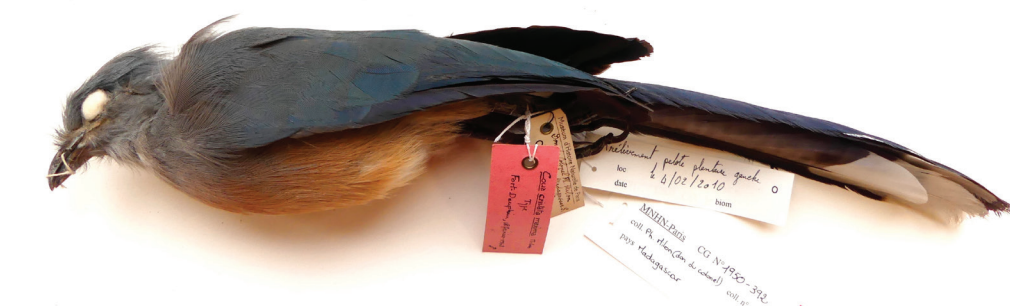
Figure 2. Holotype of Coua cristata maxima (MNHN-ZO-1950-392) in lateral view (Guy M. Kirwan)