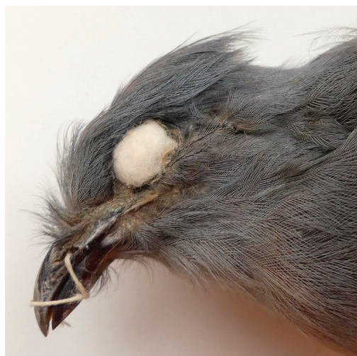
Figure 4 (left). Holotype of Coua cristata maxima (MNHN-ZO-1950-392), view of right side of head (Guy M. Kirwan)