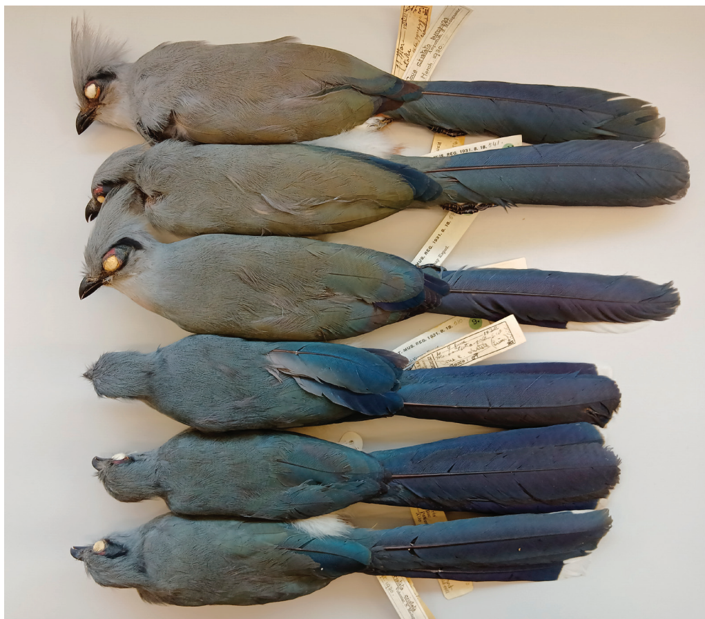
Figure 12. Dorsal view of the same three Coua [cristata] pyropyga and three C. c. cristata specimens, as in Fig. 11, in the Natural History Museum, Tring, top to bottom: NHMUK 1931.8.18.542, NHMUK 1931.8.18.541, NHMUK 1931.8.18.536, NHMUK 1931.8.18.510, NHMUK 1931.8.18.513, NHMUK 1931.8.18.515

than that it shared white ones with nominate cristata ; and (3) the known distance between the type locality of maxima and the easternmost occurrence of pyropyga is far smaller.