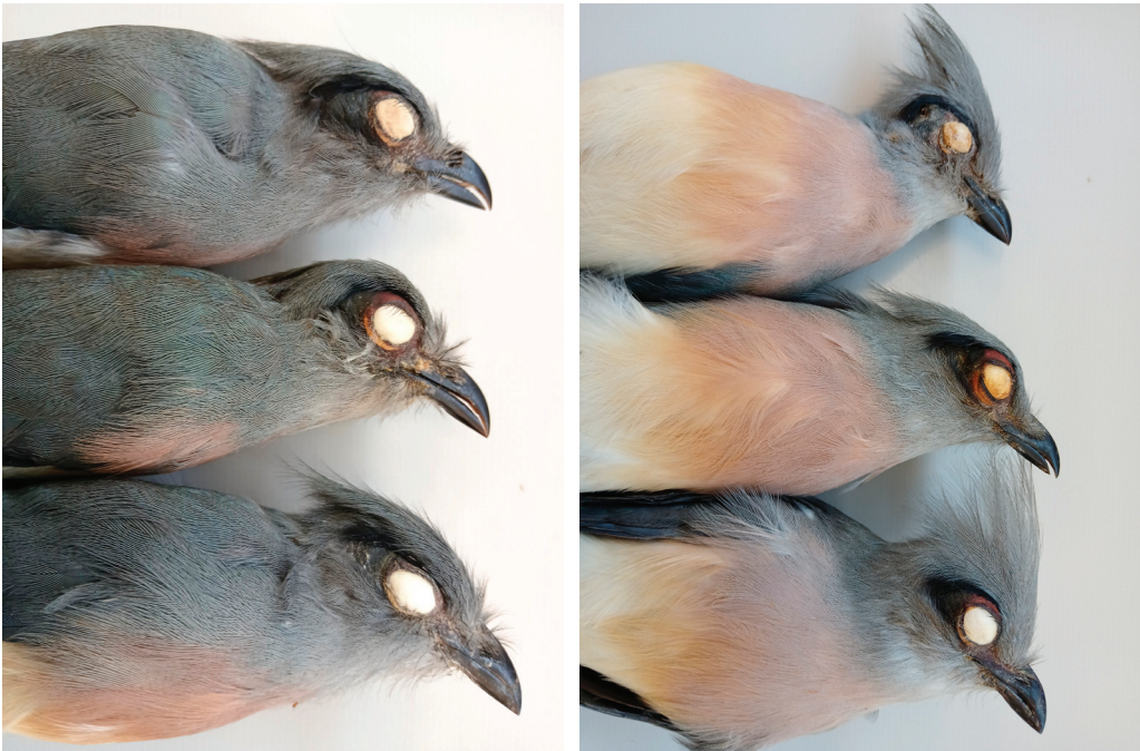
Figure 7 (left). Three heads of specimens of Coua cristata cristata held in the Natural History Museum, Tring, top to bottom: NHMUK 1931.8.18.515, 1931.8.18.513, 1931.8.18.510