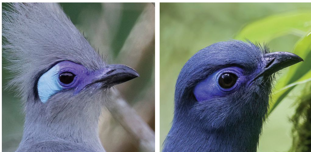
Figure 9 (left). Crested Coua Coua cristata cristata , Ankarafantsika National Park, October 2019 (detail)