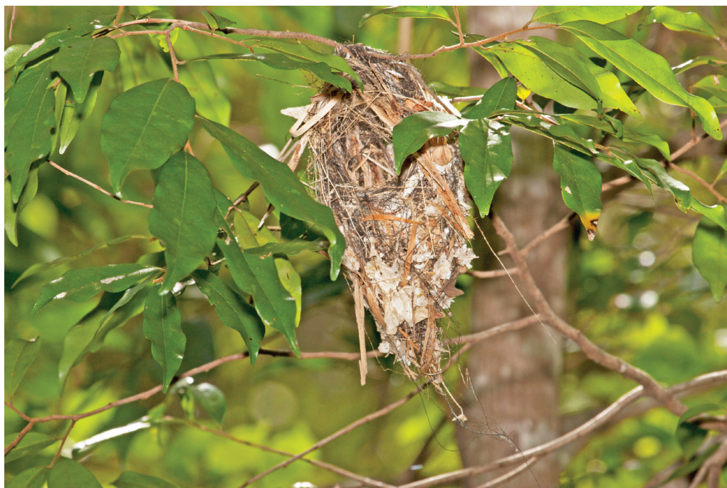
Figure 2. Suspended Schlegel's Asity Philepitta schlegeli nest, with circular side entrance aperture, at the interior-lining stage of construction by the pair in Fig. 1, Ankarafantsika National Park, Madagascar, 29 October 2008 (Clifford B. Frith)

display site ( cf. Frith 2024). Prum & Razafindratsita (1997) described and illustrated male display postures and, in light of the above, stated that there may be 'significant plasticity to their breeding system' (Prum & Razafindratsita 2022: 1691), without commenting as to how extraordinary this would be or citing any example of other birds exhibiting such a remarkably variable reproductive scenario.