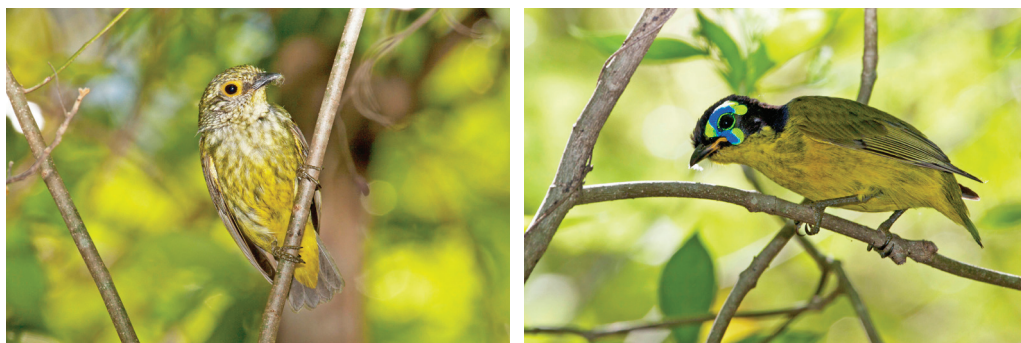
Figure 1. Female (left) and male (right) of a pair of Schlegel's Asity Philepitta schlegeli with fine nest material in the bill tip, Ankarafantsika National Park, Madagascar, 29 October 2008 (Clifford B. Frith)