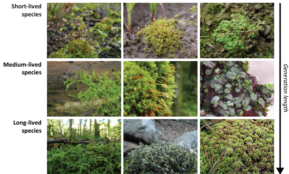
Figure 1. Examples of species with different generation lengths. Species from top left to down right: Funaria hygrometrica (fugitive), Tortula truncata (annual shuttle), Riccia glauca (annual shuttle), Lophocolea heterophylla (pioneer colonist), Ulota bruchii (short-lived shuttle), Exormotheca pustulosa (short-lived shuttle), Brachythecium rutabulum (perennial stayer), Hedwigia ciliata (long-lived shuttle), Sphagnum capillifolium (dominant; photos: A. Bergamini).

The definitions of 'individual-equivalents' as outlined above closely follow the Red List Guidelines (IUCN SPSC 2017), but they are more precise and also more explicit than those originally suggested by Hallingbäck (2007). They are used in all cases where identification of 'mature individuals' is not possible. For the European Bryophyte Red List, each individual Red List assessment of a species