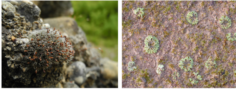
Figure 2. When species grow in discrete cushions such as Grimmia orbicularis (left) or as single rosettes ( Riccia spp., right), individuals rather than ‘individual-equivalents’ may be counted.

consistently specifies how the number of individuals was estimated when calculating population decline: 1) individuals in the strict IUCN sense, or 2) individual-equivalents as described above.