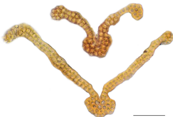
Figure 2. Leaf cross sections of Schistidium succulentum from the Glowacki-specimen (GJO 0102803). Scale: 50 µm.

However, it can easily be distinguished from S. succulentum by the short capsules (up to 1.3 \times as long as wide) and the very short rostrum formed as a mamilla. In contrast, S. succulentum has elongate capsules ( 1.5\text{--}1.7 \times ) and a distinctly rostrate lid. Another Schistidium -species with a reduced peristome is S. cryptocarpum Mogensén & H.H. Blom, known from arctic parts of Asia and North America. It differs from S. succulentum in the 1 (–2) stratose leaf margins (versus 2–4 stratose) and the campanulate (versus cylindric) capsules.