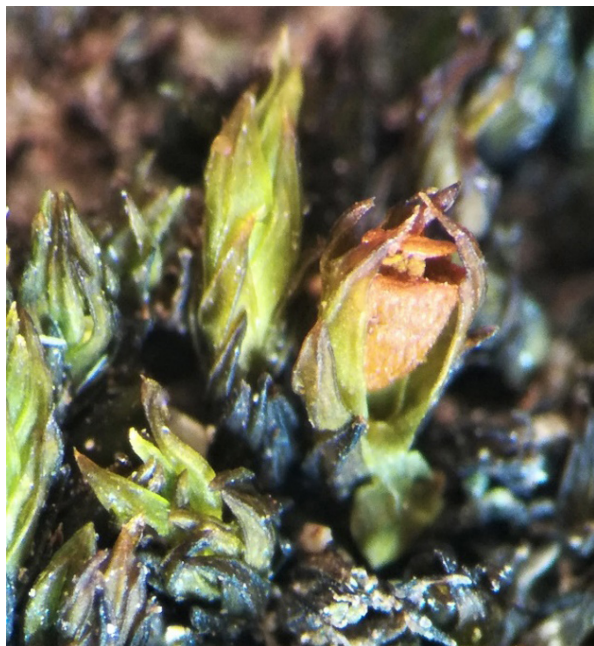
Figure 3. Plant of Schistidium succulentum from the French Alps with the perichaetial leaves that are typically inclining above the capsules (from T. Kiebach 2975).

(except in the specimen from Switzerland) clearly indicate S. succulentum . In plants from Switzerland the costa is generally less strongly projecting dorsally than in the other specimens from the Alps known to date, and the usually distinct leaf cross section with the costa set-off from the lamina (cf. Fig. 2) is evident only in some of the leaves.