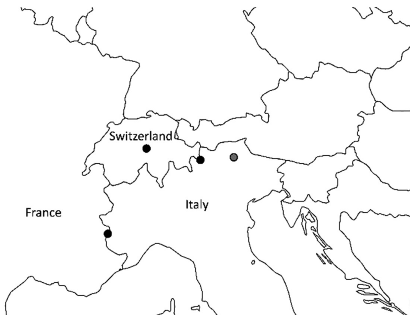
Figure 5. Known distribution of Schistidium succulentum in Europe. Previous record (grey circle; Kiebach 2020) and records presented here (black circles). The record from the border region between Italy and Switzerland was previously referred to S. subconfertum .

Anabar (Ignatova et al. 2010) are due to phenotypic plasticity, presumably in response to habitat conditions. This has support from the ITS sequences that are identical in specimens from Italy and Caucasus (Kiebach 2020). However, a certain (genetic) differentiation caused by the isolation of the alpine population of the species cannot be excluded.