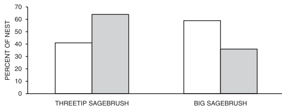
Figure 2. Expected proportion of nests (grey columns) under each species of sagebrush based on available habitat within our study site compared to the observed proportion (white columns) of each species of sagebrush used as nest cover by sage-grouse in south-central Idaho, 2005-2006.

that burned portions of the northeastern and south-eastern corners of our study site in August 2005. The burns occurred in areas where threetip sagebrush was the predominant shrub, leaving much of the big sagebrush stands intact. This had an overall effect of altering the ratio of sagebrush composition in favour of big sagebrush. Big sagebrush was the only other sagebrush species encountered, constituting 29.3% and 56.8% of the available sagebrush cover in 2005 and 2006, respectively. There was no difference in shrub species selected as nest cover between years ( \chi^2_1 < 0.001 , P = 0.987 ), indicating that fires had little effect on the actual nesting habitat used by grouse during our study and allowing us to combine data from 2005 and 2006.