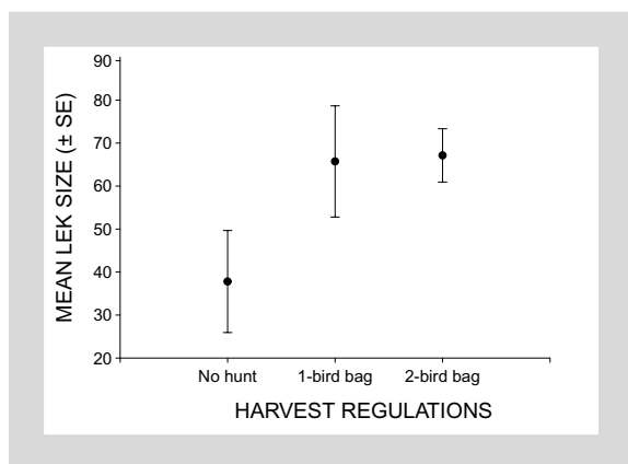
Figure 1. Relationship between harvest regulations and mean initial lek size in Connelly et al. (2003).

in which both R and K were random numbers drawn at each time step from normal distributions, N(0.2, 0.1) and N(100, 10) , respectively. Means and variances were selected to approximate those in Connelly et al.'s (2003) study. We simulated populations with beginning sizes equal to mean lek sizes in each harvest treatment at the beginning of the Connelly et al. (2003) study (Connelly