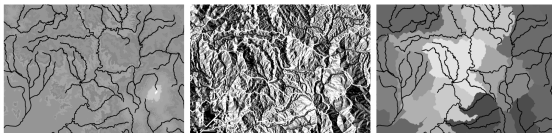
Figure 2. Given the Digital Terrain Model, GRASS can identify automatically river basins with a single command (i.e. r.watershed ).