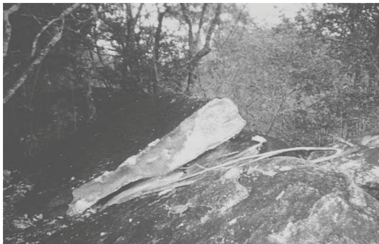
Figure 6. Physical evidence of site exploitation in Kawelu area (Mwingi district). Note the broken down rock slab and the improvised hooked extraction sticks lying on top.

Spellerberg (1992) suggests that the illegal trade in wildlife and their products threatens many species with extinction. Over-collection of tortoises for the international pet trade threatens the survival of the pancake tortoise population in Kenya. There are reports of illegal tortoise collection in many parts of Mwingi district and there was physical evidence of collection at Kawelu where a rock slab had been broken using another rock allowing freer access to the crevice inhabitants (figure 6). Tortoise collectors have visited most of the areas surveyed in Mwingi district and have had depleting effects in areas like Nguni. Incidentally, Mwingi district is the only area within the Kenyan range where local people are familiar with the species. In Isiolo, Marasbit and Samburu districts for instance most people are not familiar with the species and consequently there were no reports of tortoise trade. Collection of tortoises has a detrimental demographic effect on the population, a scenario described by Boycott & Bourquin (1988) and Klemens & Moll (1995).