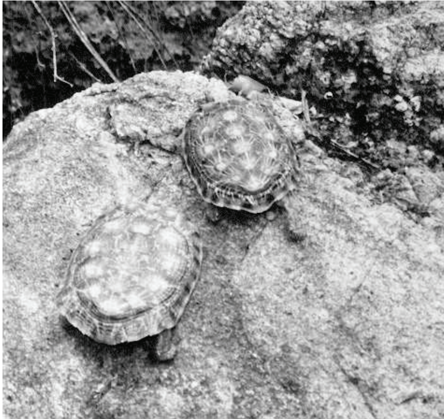
Figure 5. A pair of pancake tortoises at Kawelu (Mwingi district).