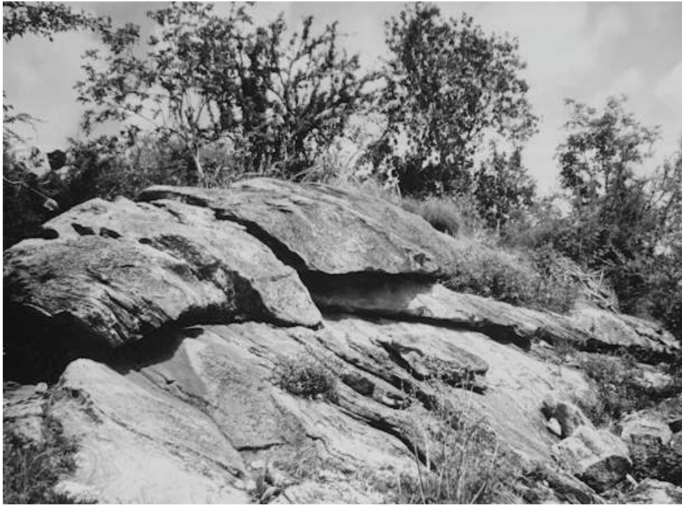
Figure 3. Typical Pancake tortoise habitat in Acacia-Commiphora bushland. Exfoliating rock slabs at Kalanga, Mwingi district.

vegetated rock outcrops. Such well sheltered rock crevices probably provide thermal buffering against overheating and desiccation during the dry season.