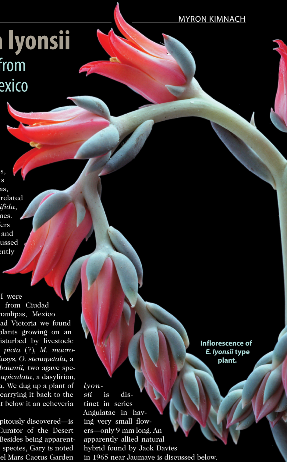
Inflorescence of E. lyonsii type plant.

In the course of his work with the Mexican Crassulaceae, Charles Uhl made eight hybrids of E. lyonsii with other Echeveria species and one with a graptopetalum 1 .