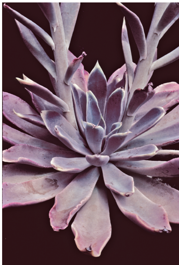
▼ The probable natural hybrid in cultivation.