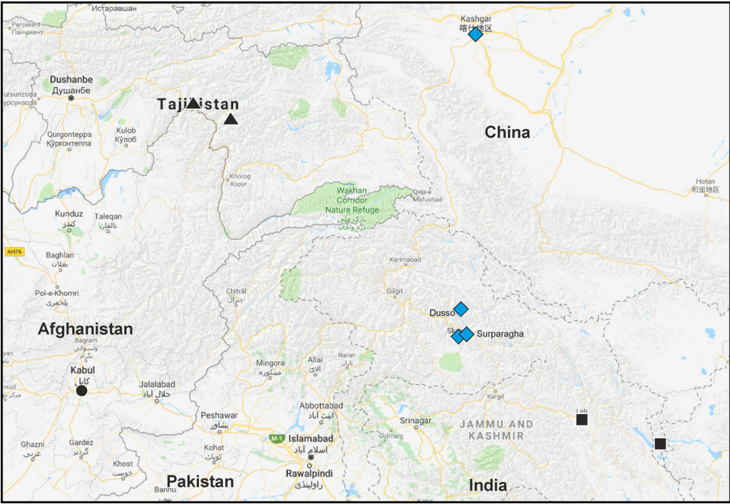
Fig. 18: Distribution records of Pholcoides species: P. afghana (dot), P. monticola (triangle) and P. seclusa (black squares refer to localities of syntypes and blue diamonds refer to records by Caporiacco (1934) and Reimoser (1935) which are most likely based on misidentifications

species), and in having a distinct carapace pattern with dark marginal stripes (vs. no marginal stripes). The endogyne of P. seclusa is most similar to those of P. afghana by having receptacles with two large lobes. Pholcoides seclusa can be distinguished from sibling species by the almost straight stalks of its receptacles (vs. roundly bent in P. afghana ) separated by more than one radius (vs. separated by less than one radius). The endogyne of P. seclusa differs markedly from P. monticola by the almost straight and less spaced stalks (vs. bent stalks separated by more than their diameter) and larger vesicles.