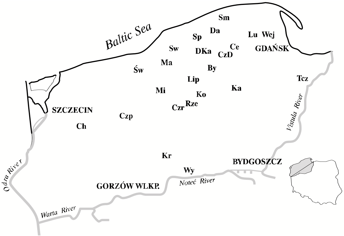
Fig. 1. Distribution of the sample plots studied within the area of Pomerania (NW Poland). 1–23 localities as in Table 1.