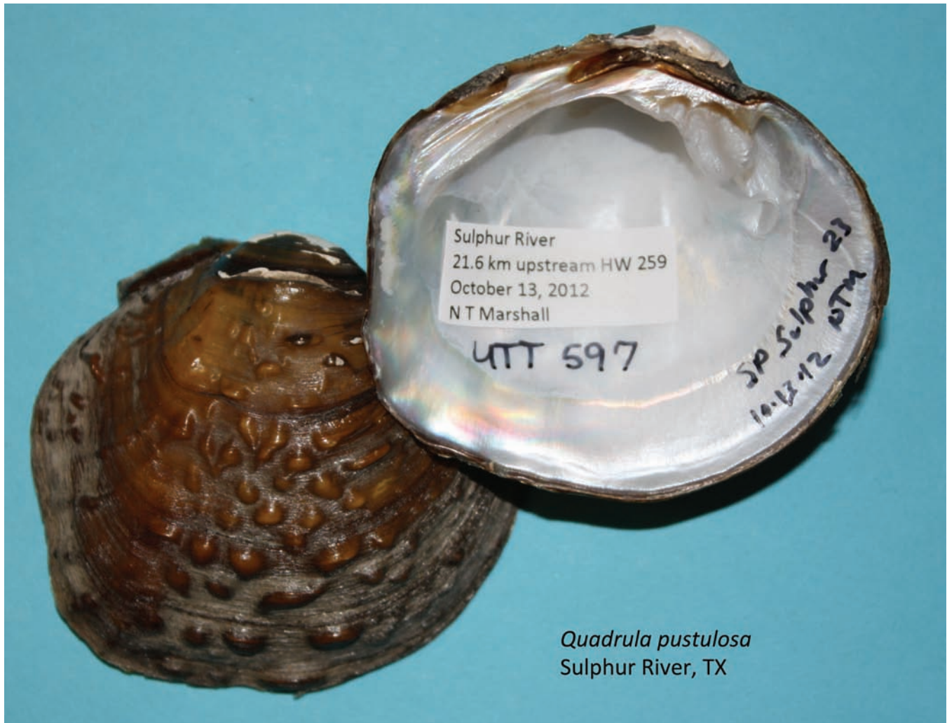
FIGURE 4 Pimpleback ( Quadrula pustulosa ) from the Sulphur River.

lienosa were found in several sites in the Neches River, one site on the Angelina River, often with two or three at a site although only 10 total live individuals were collected.