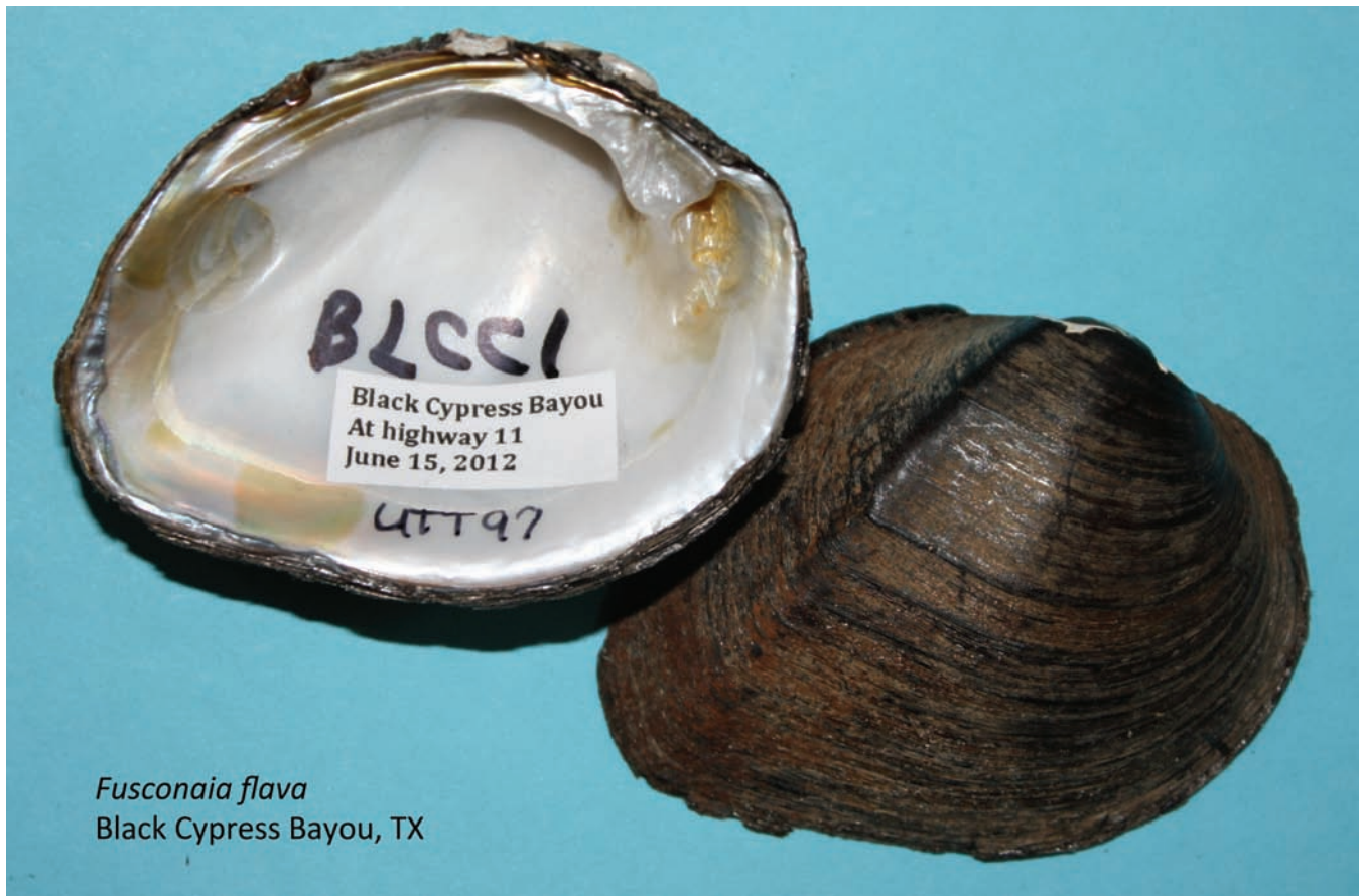
Fusconaia flava Black Cypress Bayou, TX