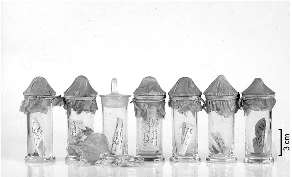
Fig. 3. Borgert's samples from Lake Victoria of 1904.

Müller's detailed list of examined samples (1904: 10–13), and Klee & Casper's statement (1992) that Müller's samples are missing, made it possible to recognize the identity as well as the value of these samples.