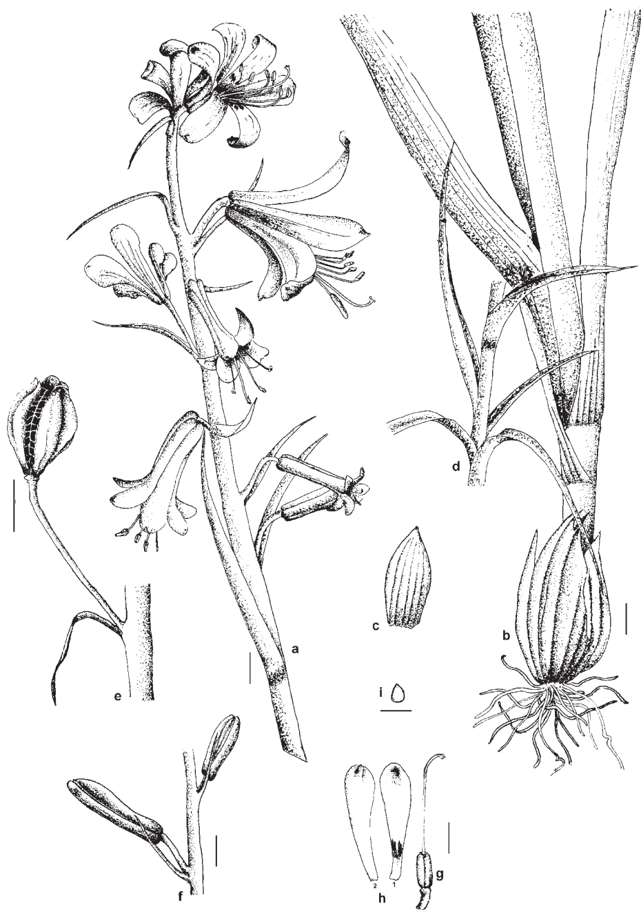
Fig. 1. Notholirion koeiei Rech.f. – a: inflorescence; b: habit; c: coat of the tunica; d: portion of the leafy stem; e: capsule; f: flower buds; g: pistil; h: tepal, dorsal (1) and ventral (2) side; i: seed. – Scale = 1 cm; drawing after plants of the population from near Aqrah.