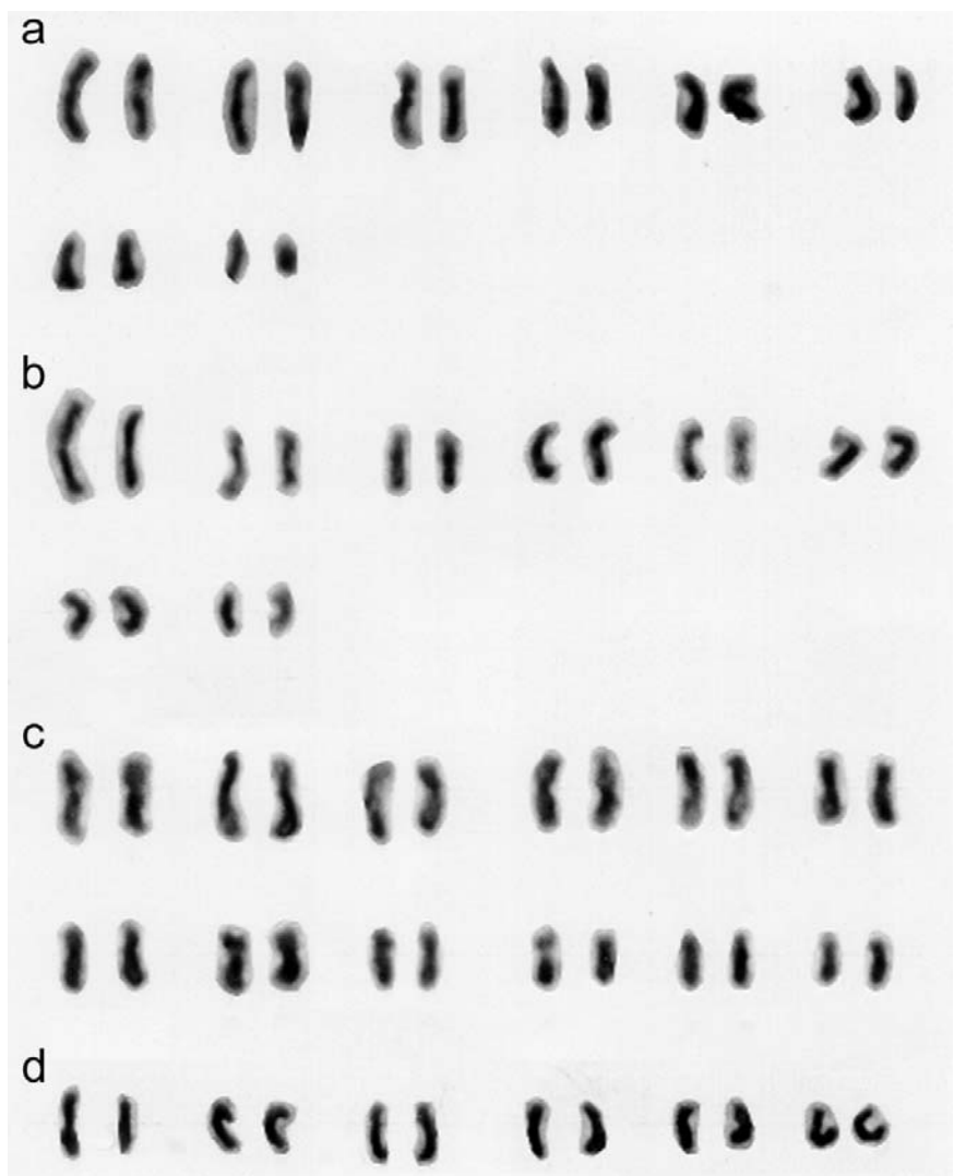
Fig. 1. Karyograms – a: Alhagi camelorum ( 2n=16 ); b: Astragalus abyssinicus ( 2n=16 ); c: Datura innoxia ( 2n=24 ); d: Moltkiopsis ciliata ( 2n=12 ). See text and Tables 1-4.

2n=32 was found by Bittrich (1986). Karyogram and karyotype analysis are shown in Fig. 2a and Table 5 respectively.