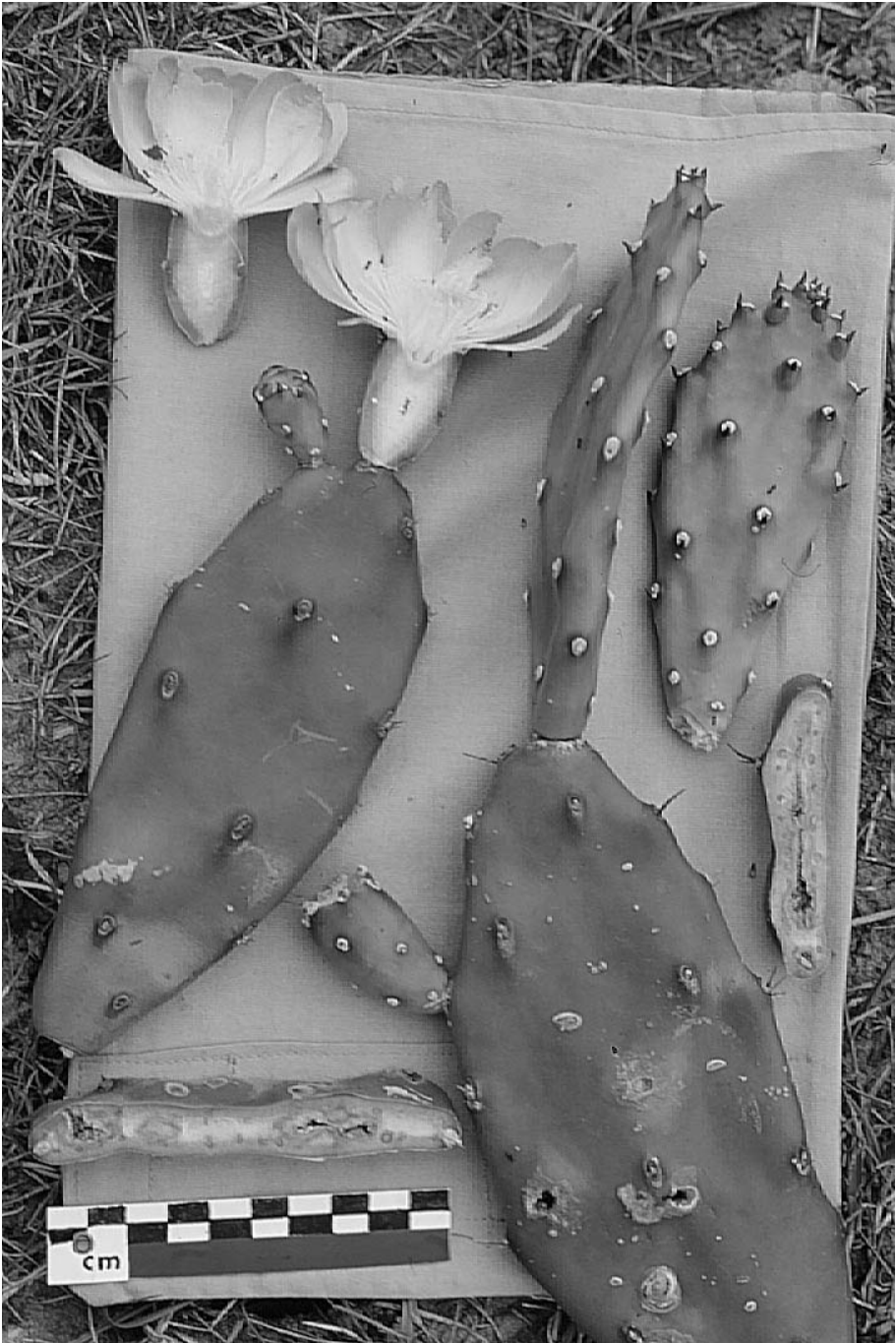
Fig. 2. Opuntia cardiosperma K. Schum. from Corrientes (Argentina), leg. Leuenberger & Arroyo-Leuenberger 4749 , material for the herbarium prior to drying.