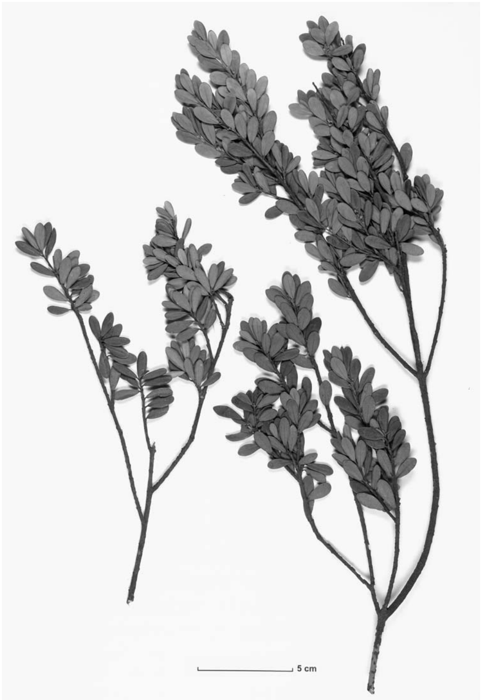
Fig. 2. Isotype specimen of Polygala guantanamana subsp. alternifolia (PFC 42965, B).