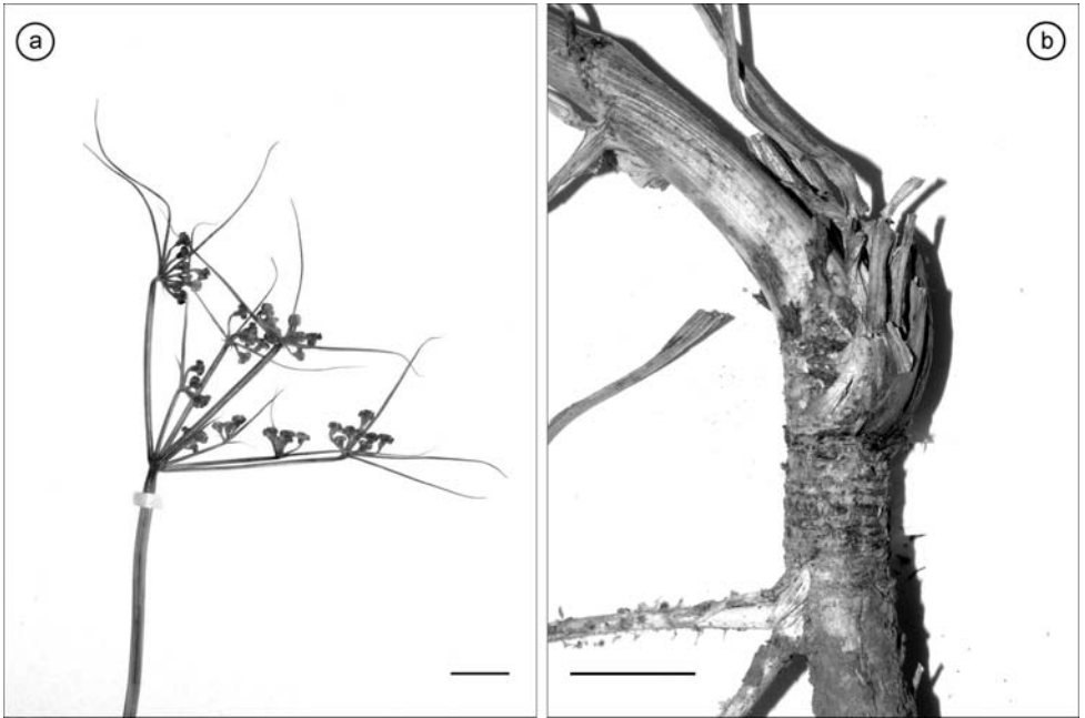
Fig. 3. Peucedanum longibracteolatum , photographs of herbarium material ( Ulrich 3/30 [holotype]) – a: compound umbel, flowering (note the extremely unequal rays and long extended bracteoles; b: rootstock with petiolar remains. – Scale bars: 0.5 cm (a), 1 cm (b).

1220 m, Steilhang, Exp. E, 25.10.2001, Ulrich 1/142 (MSB [fruiting synflorescences]). – C4 İÇEL: Silifke-Kırobasi, etwa 22 km N Silifke, 980 m, eingezäuntes, bebuschtes Gelände, 21.10.2002, Ulrich 2/61 (herb. Parolly [fruiting synflorescences]).