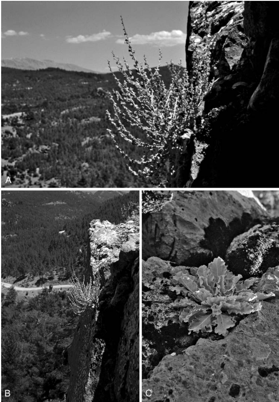
Fig. 2. Verbascum lindae in its natural habitat, Sütçüler, 16 km N of Çandır (Isparta, Turkey) – A, B: habit, flowering; C: sterile rosette.