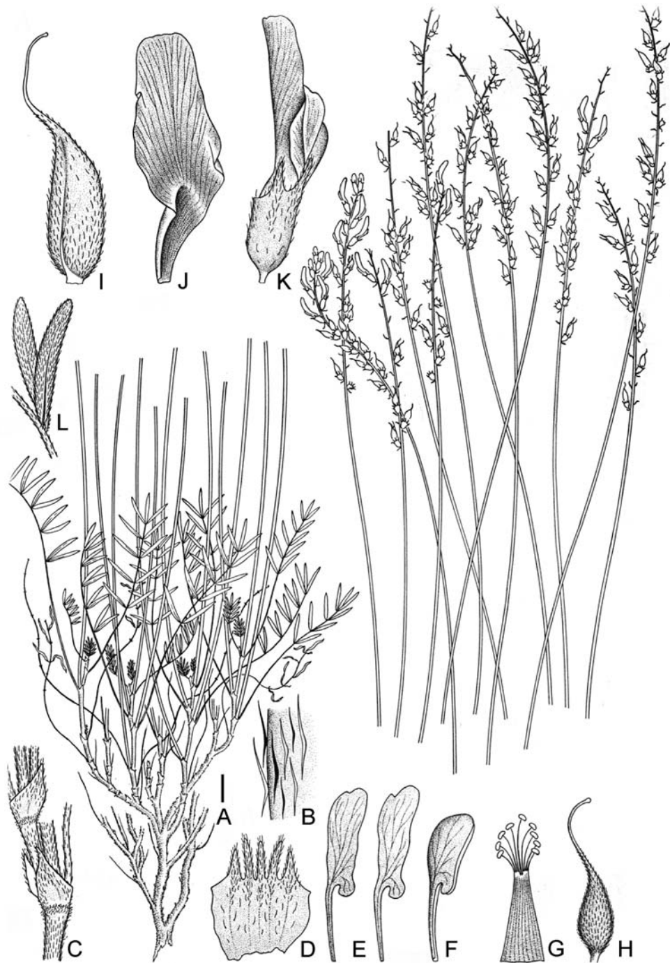
Fig. 1. Astragalus kiviensis – A: habit (with fruits); B: indumentum of calyx; C: stipules; D: calyx; E: wings; F: keel; G: androecium; H: gynoecium; I: pod; J: standard; K: flower; L: leaflet pair. – Scale bar: A = 1 cm, C, L = 2.5 mm, D-K = 1.25 mm; drawn after the type collection.