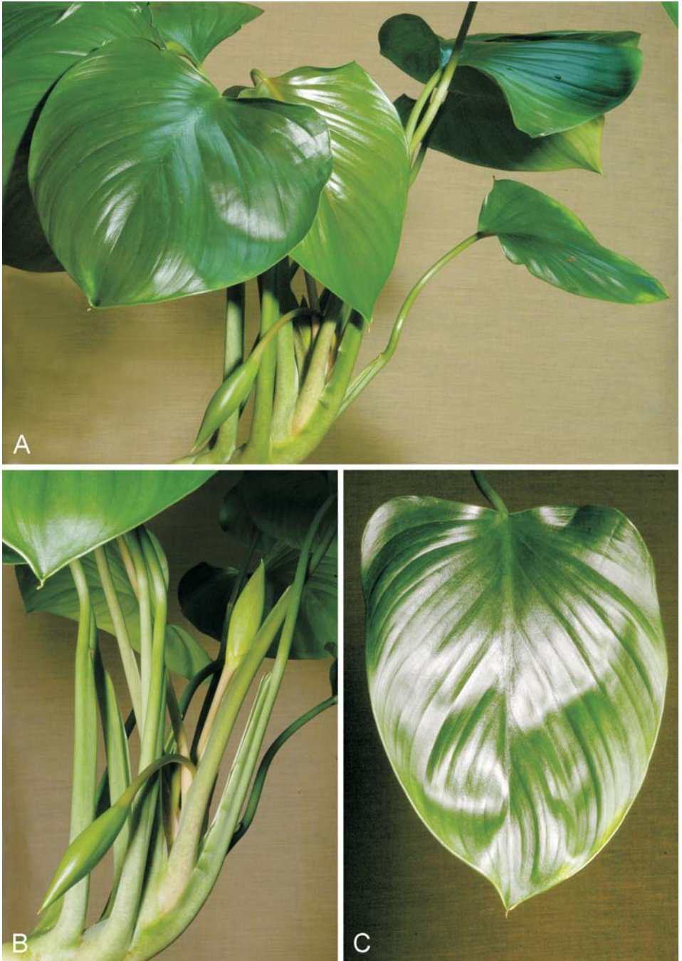
Fig. 1. Homalomena vietnamensis – A: habit of a flowering plant; B: lower part of the plant with two inflorescences, the younger one still erect and the other turned downwards after anthesis; C: single leaf, note the truncate base, the mucronate apex and the glossy upper side of the blade. – Plant cultivated at the Botanic Garden Munich from the same wild source as the holotype.