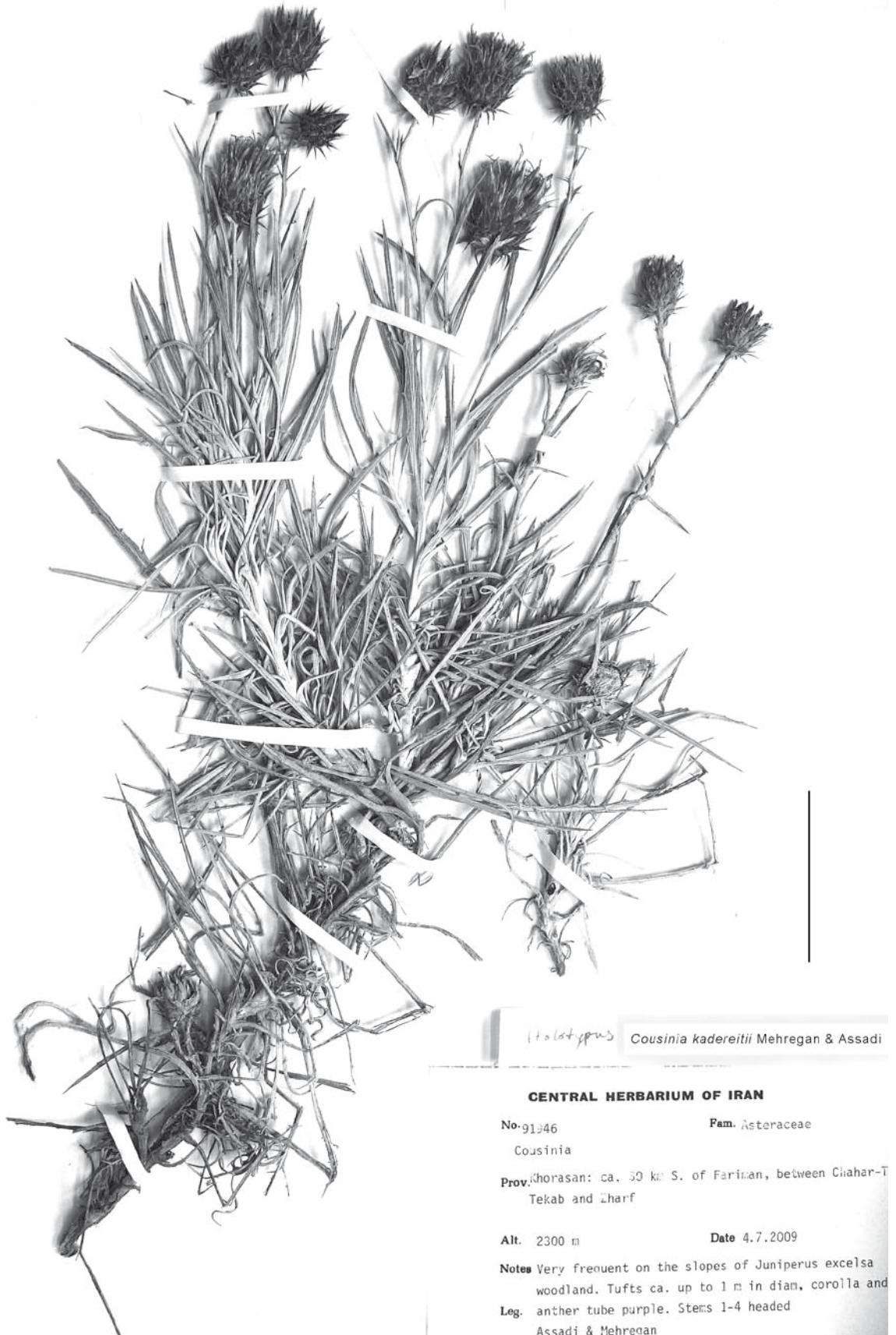
Fig. 3. Holotype of Cousinia kadereitii (Assadi & Mehregan 91946, TARI). – Scale bar = 5 cm.

Research Institute of Forests and Rangelands