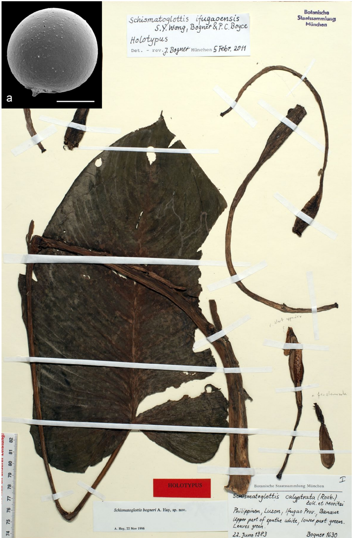
Fig. 2. Schismatoglottis ifugaoensis – holotype Bogner 1630 at M; a: pollen grain. SEM micrograph (a; scale bar = 10 µm).