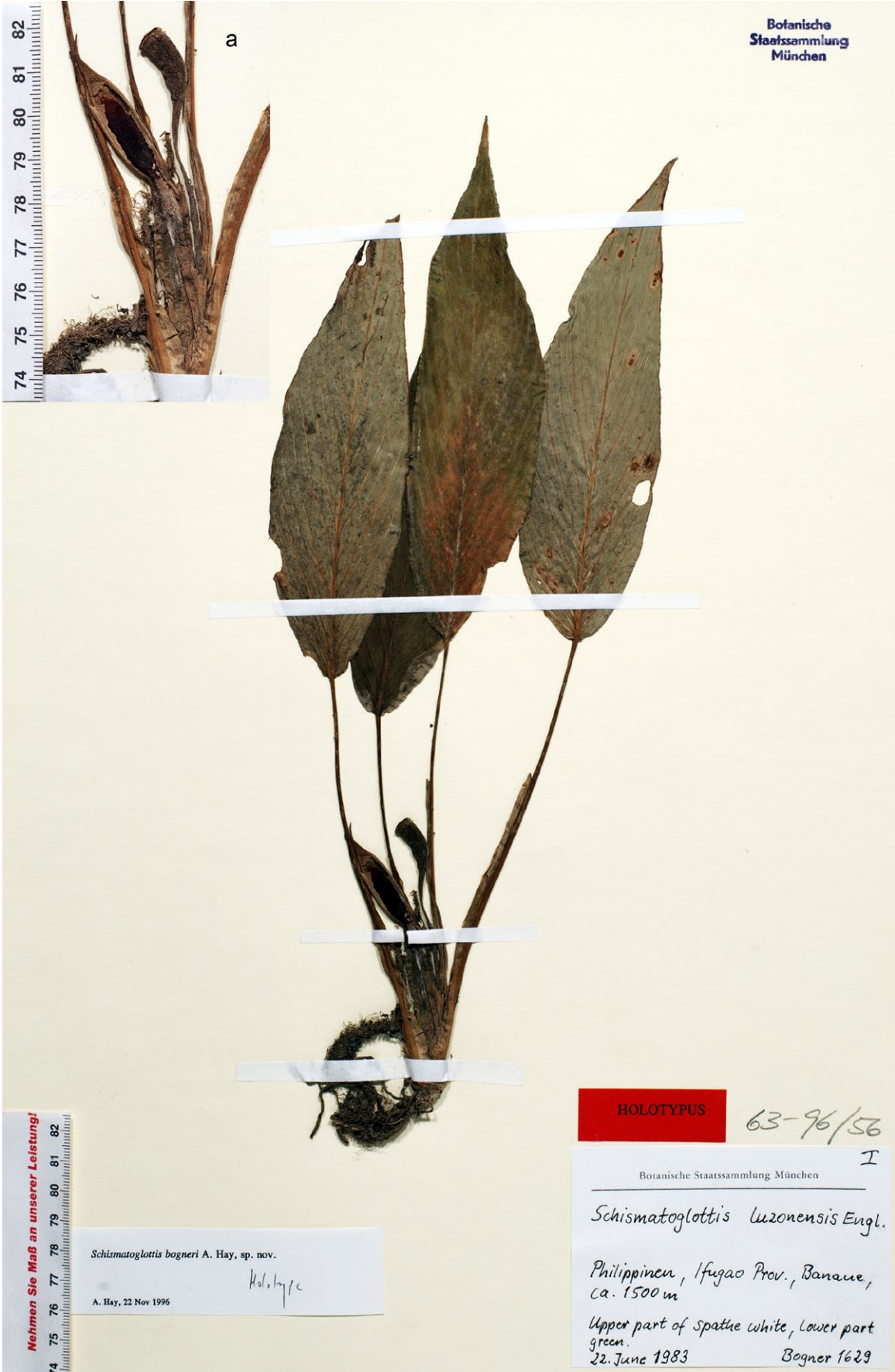
Fig. 3. Schismatoglottis bogneri – holotype Bogner 1629 at M; a: inflorescence enlarged.