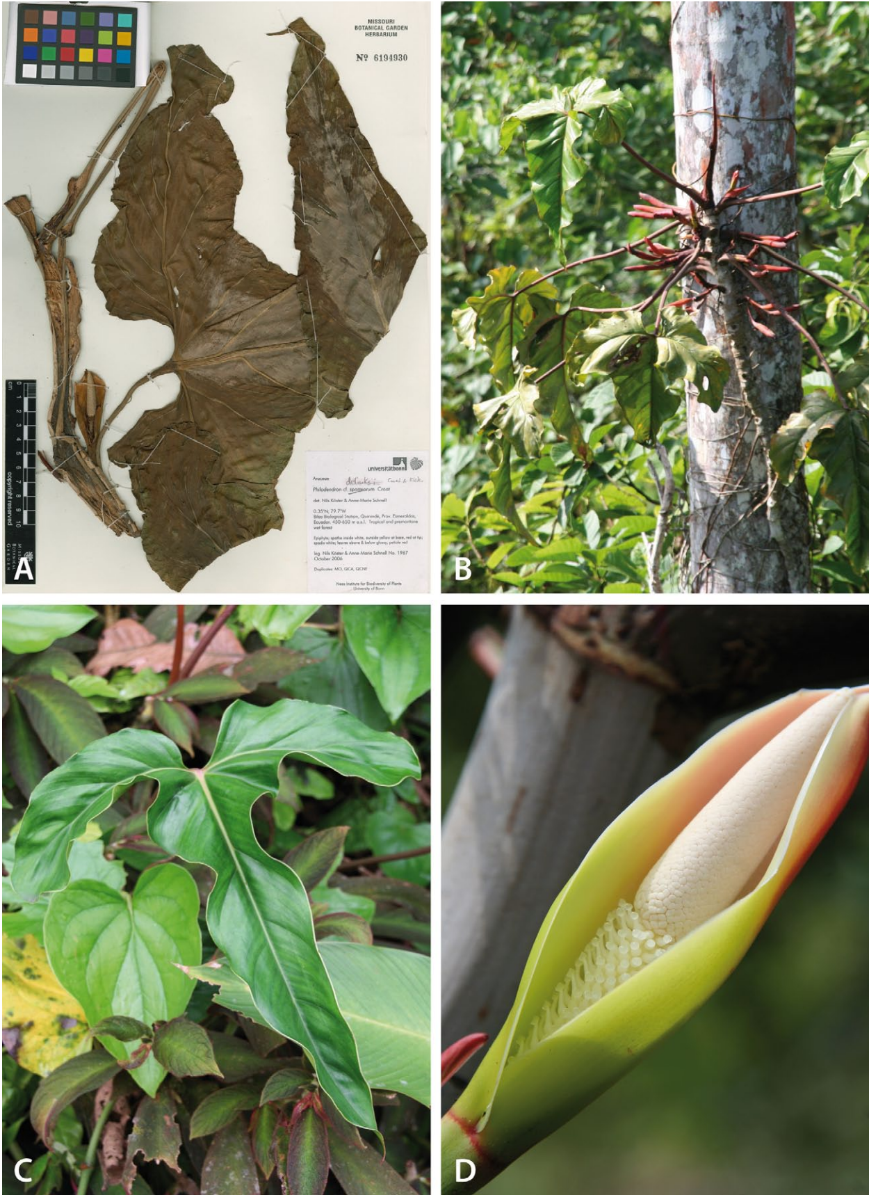
Fig. 1. Philodendron delinkii – A: holotype specimen at MO, Köster & Schnell 1967; B: habit of specimen at type locality, Ecuador, Esmeraldas, Bilsa Biological Station; C: leaf of specimen at type locality, Ecuador, Esmeraldas, Bilsa Biological Station; D: fresh inflorescence of type collection, Köster & Schnell 1967.