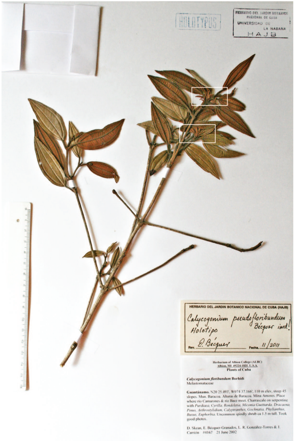
Fig. 1. Photo of the holotype of Calycogonium pseudofloribundum at HAJB; top frame: axillary flowers, bottom frame: terminal flowers.