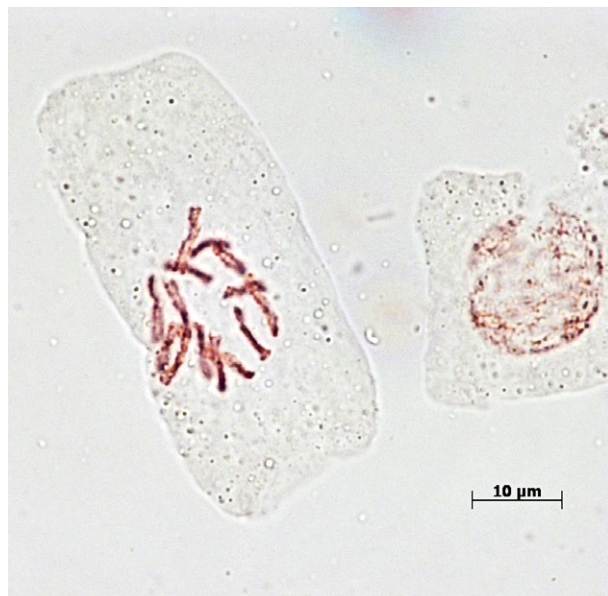
Fig. 1. Papaver paphium , metaphase of root tip mitosis, 2n = 14 .

The leaf shape of Papaver paphium is distinctive. The lower leaves have long, winged petioles covered with up to 2 mm long patent white hairs; the lamina is entire, lyrate or deeply three-lobed, rarely with two additional short obtuse lobes, usually glabrous or covered with sparse white hairs along the veins. The single (rarely two) cauline leaf near the stem base is sessile. The petals are contiguous, delicate pale orange, lacking dark marks. The stigmatic disc has 5–7 crenate, rounded lobes with a hyaline margin, the radiating stigmas do not reach the tip of the lobes.