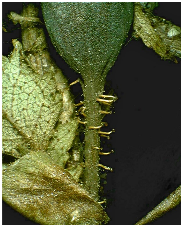
Fig. 3. Rosa micrantha subsp. chionistrae – lower part of the hypanthium with a rather long, glandular-setose pedicel; at the left side the lower surface of a leaflet with glands ( Hand 5070).

The following remarks are based on field studies (supported by C. S. Christodoulou) and the material cited below. Some characters not present in herbarium specimens were noted in the field. The first author analysed the characters of these samples and compared it with the detailed description of Rosa chionistrae by Meikle (1977), the protologue of Lindberg (1942) and with high resolution photos of the syntypes in the herbarium of the University of Helsinki (H). We supplement in the following, in