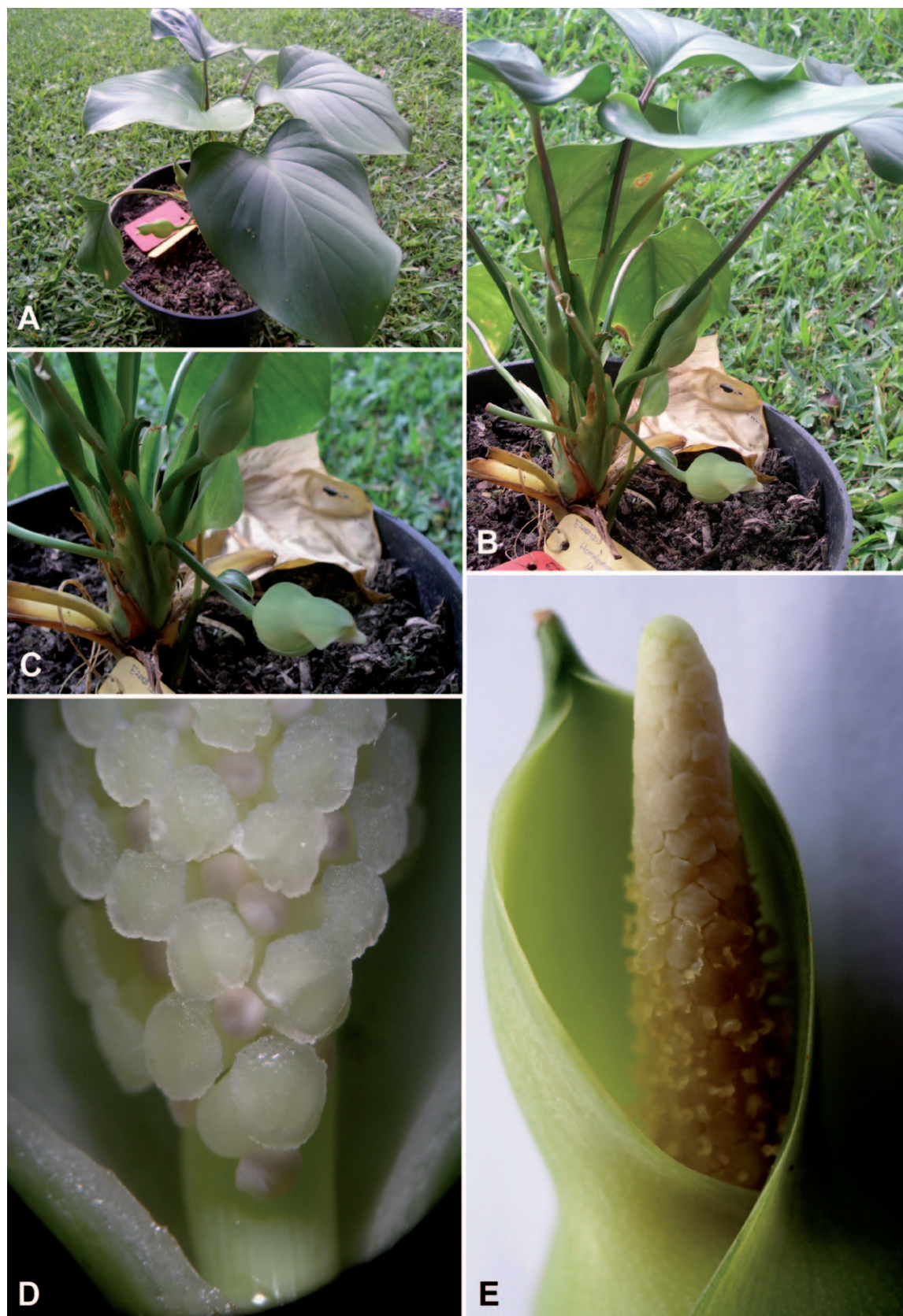
Fig. 1. Homalomena tirtae – A–C: habit of the plant in cultivation in the Bali Botanic Garden, source of the holotype; note the green spathe, open petiolar sheath and the brownish staining of the petiole; D: detail of pistillate flower zone at pistillate anthesis, showing the pistils exceeding the interpetillar staminodes and the 3-lobed stigmas; E: inflorescence at late staminate anthesis; note that the terminal portion of the spadix is composed of sterile staminate flowers (no pollen strings released). – from I Gede Tirta GT.2105 cultivated as accession E20051213 in the Bali Botanic Garden.