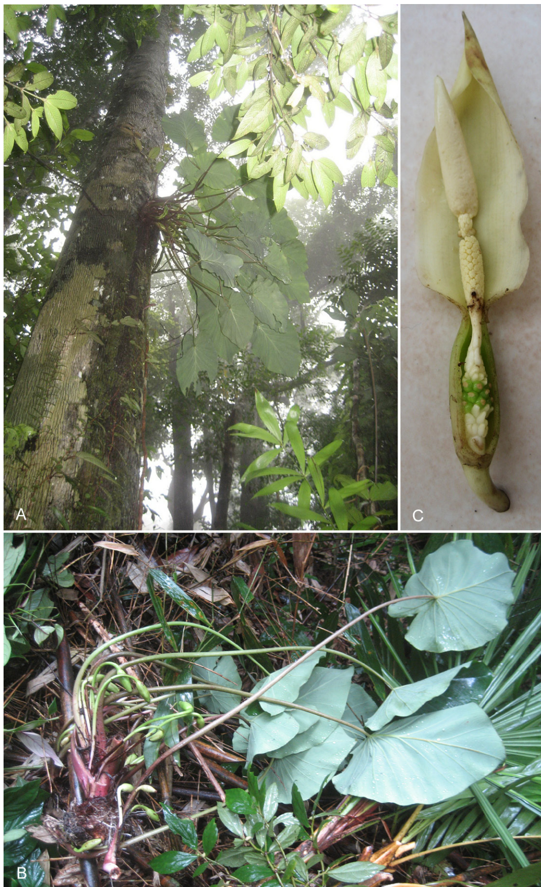
Fig. 4. Alocasia vietnamensis – A: plant in habitat; B: habit; C: inflorescence with spathe tube opened to show spadix. – Photographs: Vietnam, Da Nang province, Ba Na-Nui Chua National Park, 24 Oct 2008, V. D. Nguyen.