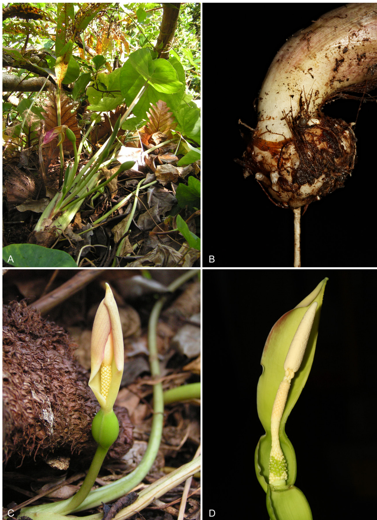
Fig. 2. Alocasia evrardii – A: plant in habitat; B: tuberous stem; C: inflorescence at anthesis; D: young inflorescence with spathe tube opened to show spadix. – Photographs: Vietnam, Binh Thuan province: Takou Nature Reserve area, 2 Oct 2009, H. T. Luu.