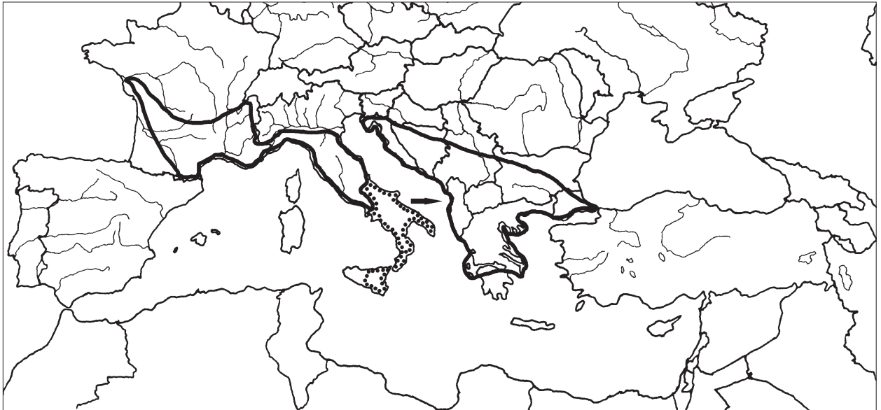
Fig. 5. Distribution of Sedum ochroleucum subsp. ochroleucum (solid line) and S. ochroleucum subsp. mediterraneum (dotted line). The arrow indicates a possible migration route via a former land bridge between Italy and the Balkan Peninsula.