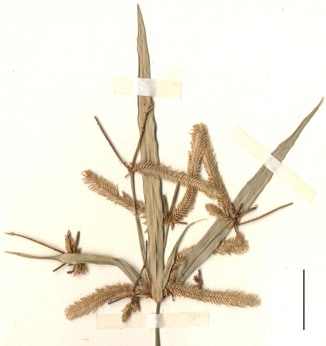
Fig. 3. Cyperus altsonii – close-up of inflorescence, J. Florschütz & P. A. Florschütz 1414 (U) from Suriname. – Scale bar = 2 cm.

SURINAME: Suriname River at Goddo, 26 Jan 1926, Exp. ped. Wilhelmina-Gebergte 99 (U [2 sheets]); Van Asch Van Wijcks Mountains, near Ebba Top base, 14 Feb 1951, J. Florschütz & P. A. Florschütz 1414 (U [Fig. 3]).