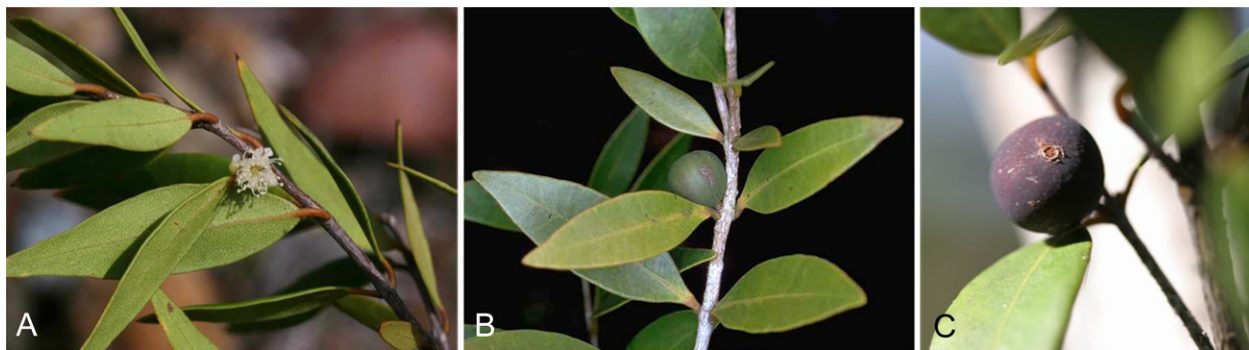
Fig. 2. Plinia bissei – A: leafy branchlet with flower and flower bud; B: leafy branchlet with unripe fruit; C: leafy branchlet with ripe fruit. – Cuba, Prov. Holguín, Yamanigüey, Jan 2004.

rivers that cross areas of slates. Isolated individuals have been found in other forest types with poorly drained soils.