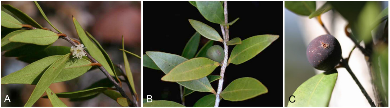
Fig. 2. Plinia bissei – A: leafy branchlet with flower and flower bud; B: leafy branchlet with unripe fruit; C: leafy branchlet with ripe fruit. – Cuba, Prov. Holguín, Yamanigüey, Jan 2004. – Photographs by Zenia Acosta Ramos.

rivers that cross areas of slates. Isolated individuals have been found in other forest types with poorly drained soils.