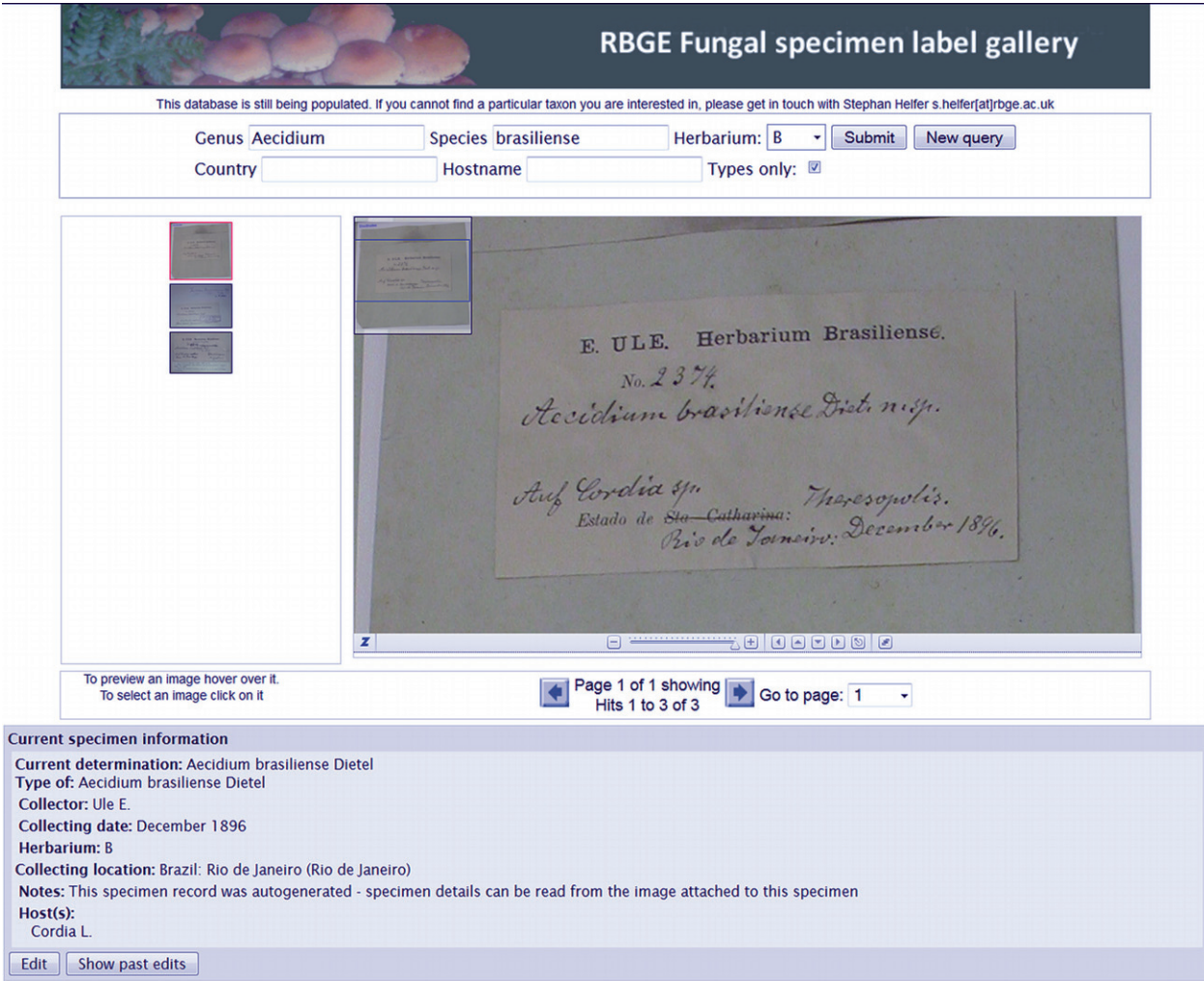
Fig. 1. Screen shot from the web resource for the rust herbarium specimen database based at the Royal Botanic Garden Edinburgh.

tinued, and a new initiative of online information about the availability of type specimens is necessary, including for the fungi. The project described in this paper aims to contribute to such an initiative for type specimens of rust fungi ( Uredinales or Pucciniales ). The main advantage of the approach taken here, compared with initiatives involving dedicated digitization stations, is the speed at which whole herbaria can be imaged.