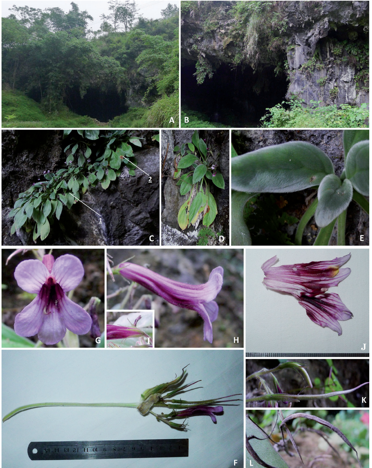
Fig. 3. Primulina argentea – A & B: habitat at type locality; C: plants of P. argentea (1) and P. orthandra (2) growing side by side; D: habit; E: leaves, showing dense, appressed, sericeous-villous indumentum; F: cyme; G: frontal view of flower; H: lateral view of flower; I: calyx lobes; J: opened corolla; K: young capsule; L: mature capsule. – Photographs by Fang Wen, type locality of P. argentea , 19 Sep 2012.

Ecology — Locally abundant in rock crevices on moist shady cliffs at the entrance of a limestone cave at an altitude of 200 m. The annual average temperature of Liannan is 19.5 °C; the average annual precipitation is 1570 mm.