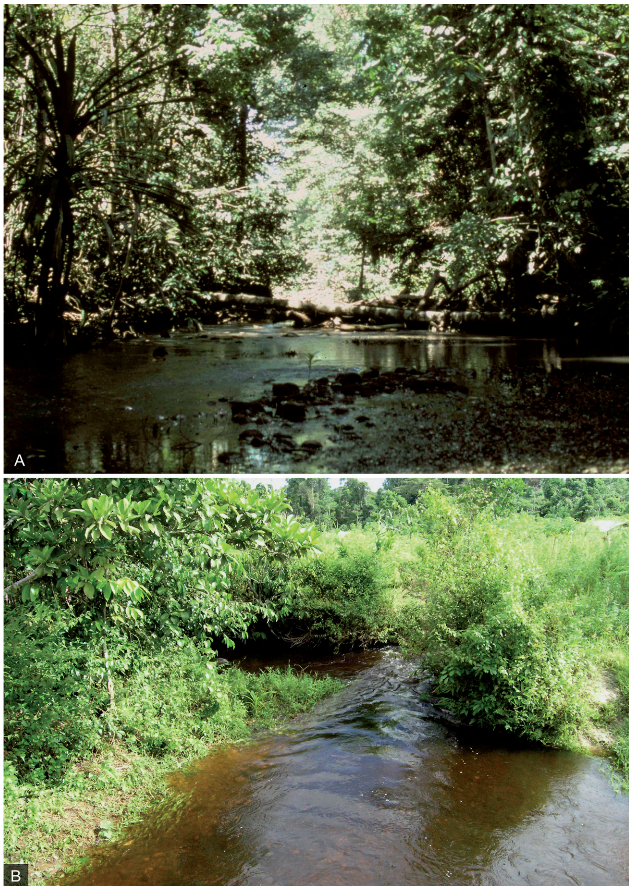
Fig. 2. Cryptocoryne versteegii var. jayaensis – A: habitat of dense stands (bottom right) in slow-flowing water at type locality in forest at Kali Kopi; B: habitat W of Timika showing forest clearing.