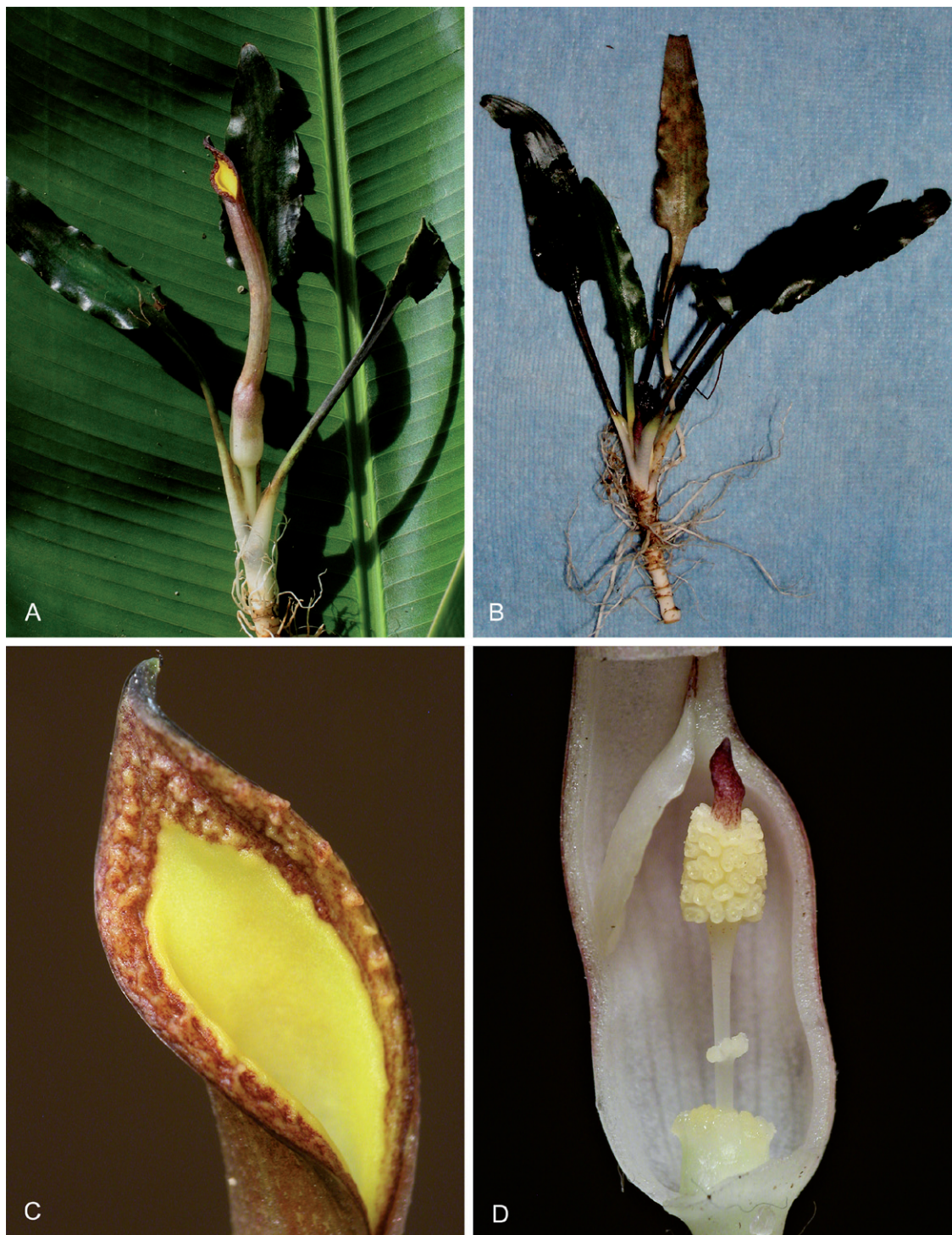
Fig. 5. Cryptocoryne versteegii var. jayaensis (plants from W of Timika) – A: habit of plant with open spathe; B: habit showing an almost mature fruit between leaf petioles; C: limb of spathe showing pronounced yellow collar/collar zone and brown rough distal part; D: cut-open kettle of spathe showing spadix with purple appendix and a few displaced male flowers on thin part of spadix axis (cultivated).

versteegii is considered to be a mangrove plant (or a plant growing on tide-influenced mudflats), with green, triangular, short, thick leaf blades, their texture resembling those found in the other typical mangrove species, viz. C. ciliata and C. lingua Engl. (from Sarawak), while the Timika plants are freshwater plants with lanceolate,