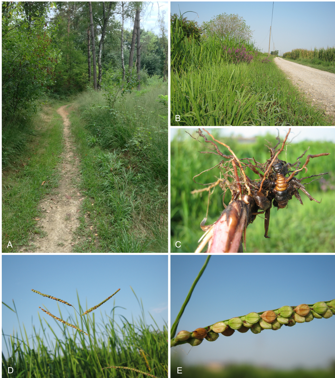
Fig. 1. Paspalum thunbergii in Italy. – A: forest path in Boscaccio; B: roadside ditch in Mortara; C: rhizome; D: inflorescence; E: spikelets. – A: Boscaccio, photographed in August 2015 by Guido Brusa; B–E: Mortara, photographed in August 2015 by Nicola Ardenghi.

pubescent, especially along the margins (vs acuminate at the apex, with long-ciliate margins). Moreover, P. thunbergii typically has upper glumes that are 3-veined with a very prominent central vein and marginal lateral veins (vs 5–7-veined upper glumes in P. dilatatum ). Also, both species are ecologically rather different (see below). Paspalum thunbergii and P. dilatatum locally have likely been confused in Italy or elsewhere in Europe. However, a revision of herbarium specimens of the latter in some herbaria (BER, BR, HBBS, GENT, MSNM, PAV and TO; acronyms according to Thiers [continuously updated]) only yielded one supplementary record of P. thunbergii (see specimens examined).