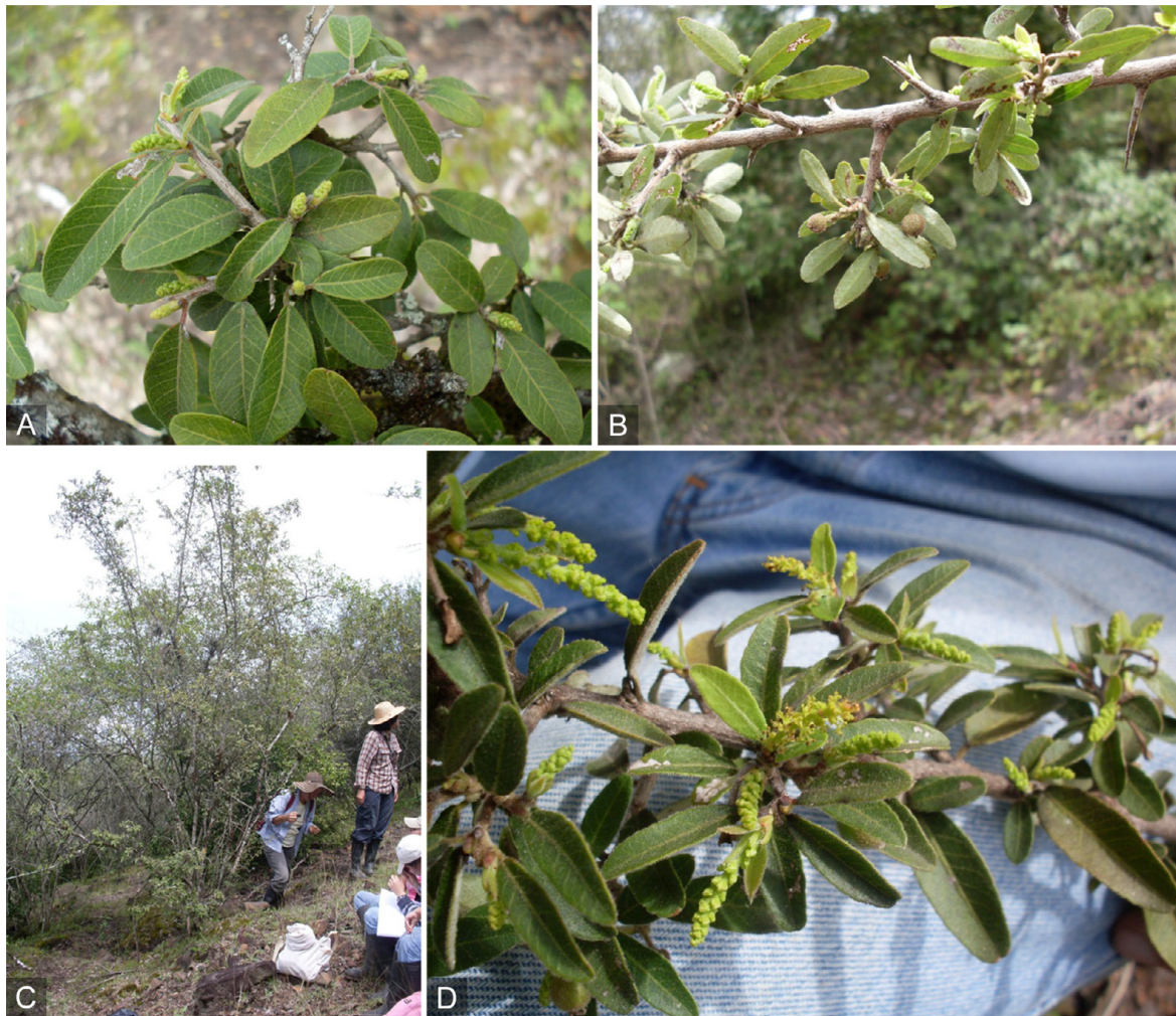
Fig. 2. Gymnanthes hirsuta – A: branch showing leaves from above and inflorescence buds; B: branch showing leaves from below and fruits; C: habit, whole plant; D: detail of branch with open inflorescence. – Colombia, Valle, Mun. Roldanillo, Hacienda Churimal, 28 Mar 2009, photographs by Philip Silverstone-Sopkin.

visible latex, monoecious; lateral branches stiff, terminating in a spine-like, leafless tip, with erect, simple, pale hairs 0.5–0.6 mm long. Leaves alternate; stipules soon caducous and rarely seen, 2–3 × 1.2–1.5 mm, membranous, with scattered hairs, margin entire; petiole 3–7 mm long, hirsute, eglandular; leafblade discolorous, distinctly glaucous-papillate abaxially, elliptic, 2–6.5 × 0.8–2.5 cm, 2.4–2.6 × as long as wide, subcoriaceous to coriaceous, base acute, margin subentire with indistinct teeth, apex rounded-subobtuse; densely to sparsely hirsute abaxially with hairs similar to branches, slightly longer on midrib, with scattered hairs adaxially, dense on midrib, a pair of marginal glands on margin near base, c. 0.35 mm in diam., 0–2 additional glands on each half, otherwise eglandular; lateral veins in 10–12 pairs, not triplinerved, veinlets reticulate, indistinct. Inflorescences axillary, unbranched, reddish in bud, later greenish. Pistillate flowers usually solitary; pedicel c. 4 mm long, hirsute; sepals 3, free, c. 0.25 × 0.25 mm; ovary with 3 carpels, smooth, hirsute; styles free, undivided, c. 2 × 0.25 mm. Staminate inflorescences yellowish, 4–7