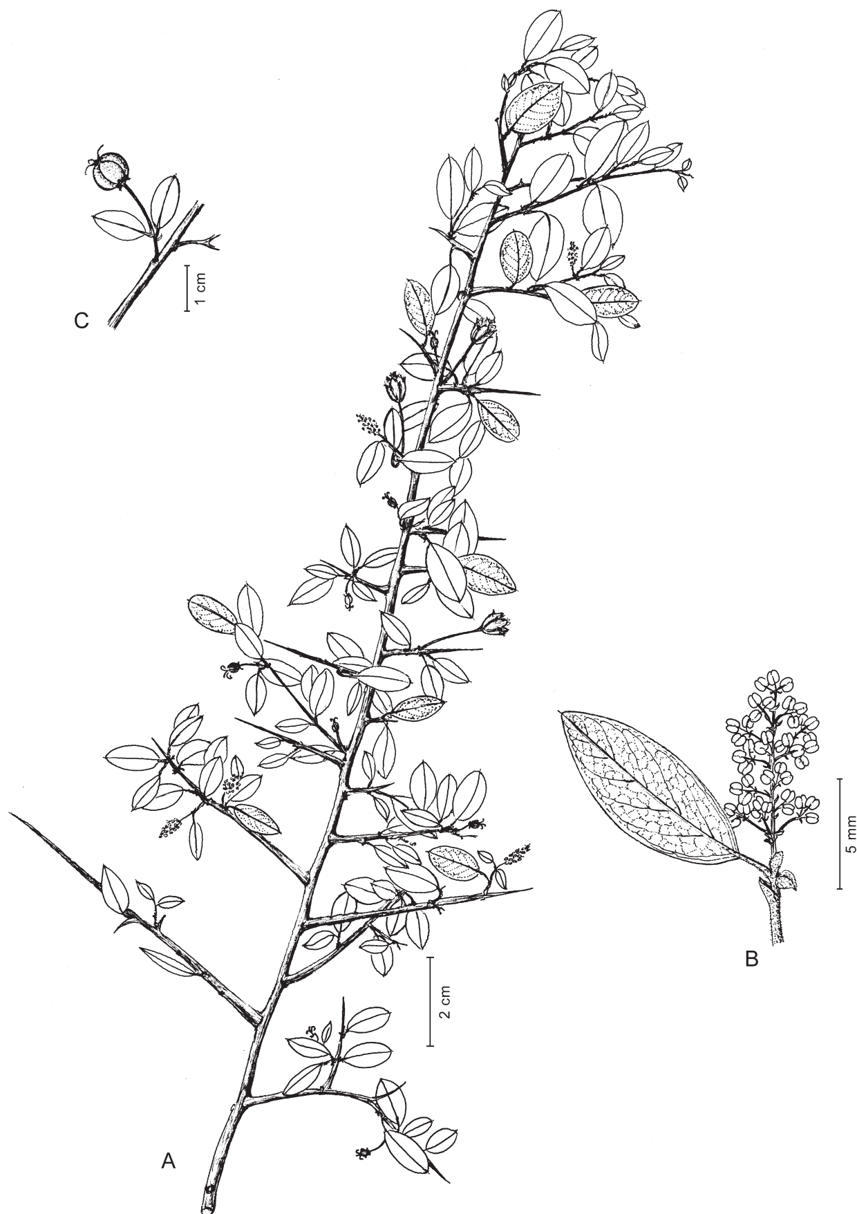
Fig. 3. Gymnanthes microphylla – A: habit; B: staminate inflorescence; C: non-muricate fruit. – All from Wood 21187 (LPB). – Drawn by Carlos Maldonado.