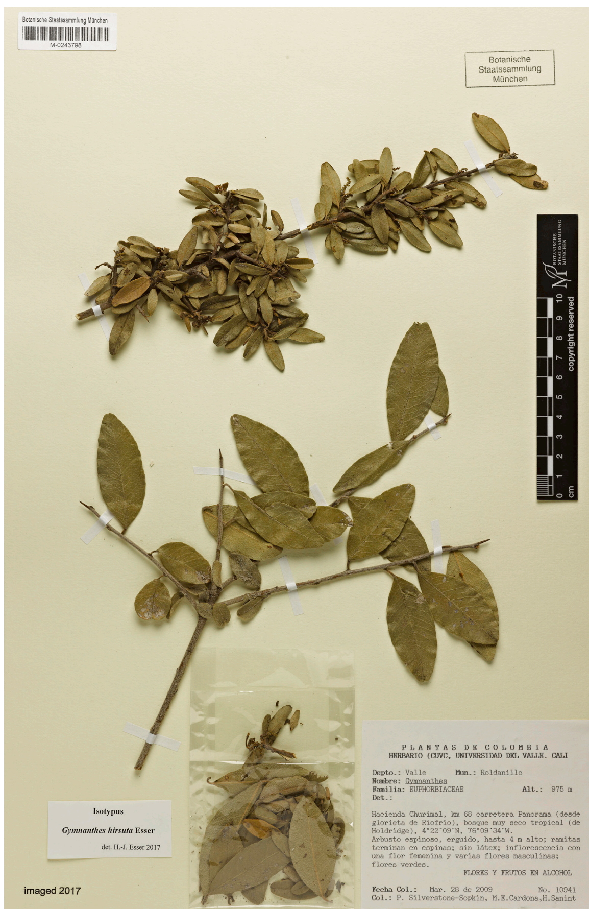
Fig. 1. Isotype of Gymnanthes hirsuta – Silverstone-Sopkin & al. 10941 (M 0243798).